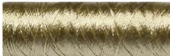
Madeira Rayon №40 col. 1338

Let's add some colour to the tiny creatures. With one strand of rayon thread (beige) fill in the body of the bird. Spread the stitches following the body curves (see the photograph on the left).