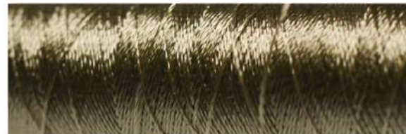
Madeira Rayon №40 col. 1136

With one strand of rayon thread (light-umbra) fill in the wings.