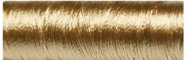
Madeira Rayon Nº40 col. 1055

Change the thread and fill in the second leaf right the same way.