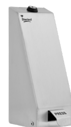
Item no. 4569 Dispenser 0.7 l, robust and lockable, stainless steel. Dimensions: 260 x 102 x 140 mm.