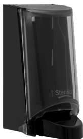
Item no. 4552 Dispenser 0.7 l, plas- tic, black with tinted transparent cover. Dimensions: 200 x 115 x 120 mm.