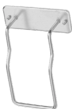
Item no. 4573 Hospital bed mount, metal. Fits all 0.7 l Ster- isol dispensers.