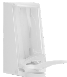
Item no. 4547 Dispenser 0.7 l, plastic, white with transparent cover. Plastic lever dispenser. Dimensions: 200 x 110 x 200 mm.