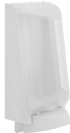
Item no. 3551 Dispenser 2.5 l, plastic, white with transparent cover. Dimensions: 340 x 180 x 130 mm.