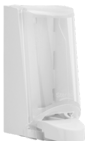
Item no. 4551 Dispenser 0.7 l, plastic, white with transparent cover. Dimensions: 200 x 115 x 120 mm.