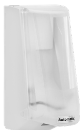
Item no. 4546 Automatic dispens- er 0.7 l, white with transparent cover. EMC-approved. Battery operated. Batteries not included. Dimensions: 228 x 117 x 130 mm.