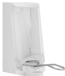
Item no. 4567 Dispenser 0.7 l, plastic, white with transpar- ent cover. Metal lever dispenser. Dimensions: 200 x 110 x 200 mm.