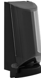
Item no. 3552 Dispenser 2.5 l, plas- tic, black with tinted transparent cover. Dimensions: 340 x 180 x 130 mm.

Item no. 4551, 4552: POM / PAGF / PC / ABS