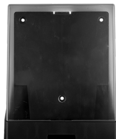
Item no. 4535 Dispenser 5 l plastic, black with tinted trans- parent cover. Dimen- sions: 250 x 210 x 185 mm.