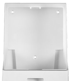
Item no. 4531 Dispenser 5 l, plastic, white with transparent cover. Dimensions: 250 x 210 x 185 mm.