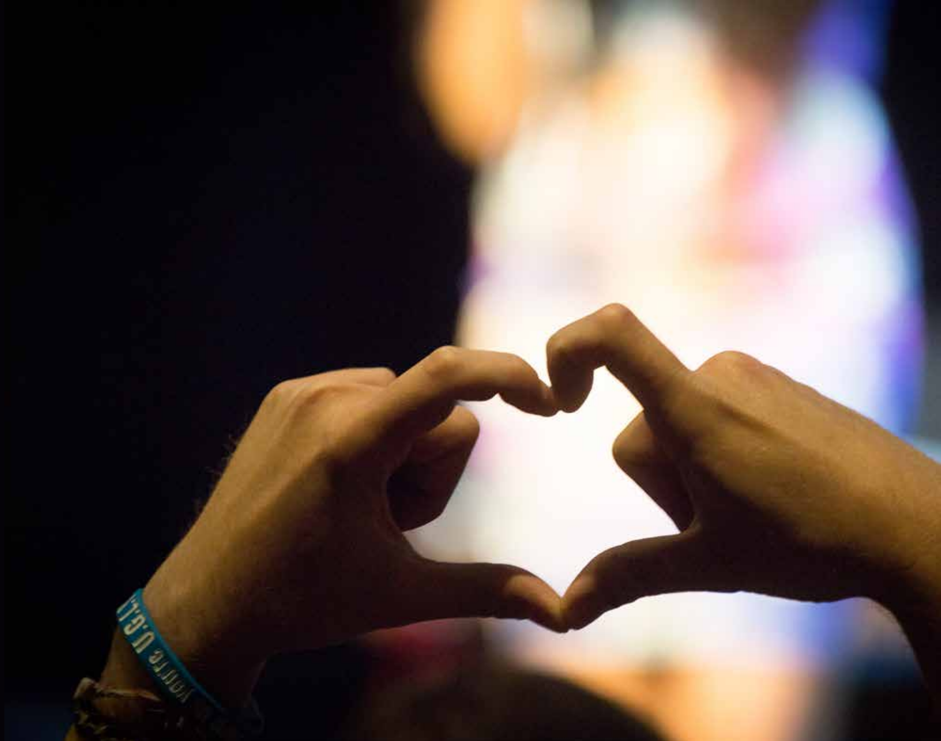
Image: Common Ground, Mapping Melbourne 2016

Common Ground is an inter-faith spoken word program of workshops and performances driven by young people and exploring the role faith and identity play in our lives. It has provided young people with opportunities to connect with each other, to develop new creative ideas around their diverse faiths and identities and to promote social cohesion and mutual understanding.