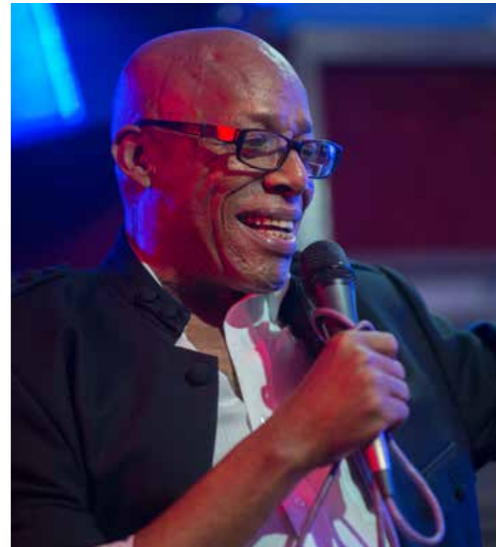
Image: Emerge at Twilight 2013 youth stage.