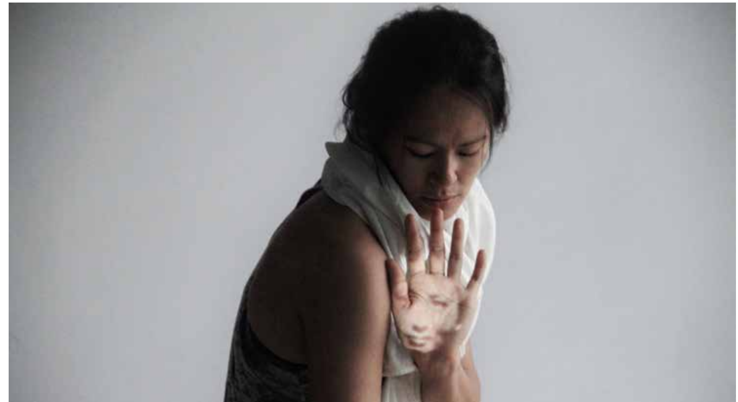
Image: Swanston St, Bluestonia Paperhood 2017

Bluestonia Paperhood 2017 is organised by Multicultural Arts Victoria (MAV), CAST RMIT University, in partnership with Time of Art, Changzhou Qing Yun Ge Art and supported by People's Government of Jiangsu Province, People's Government of Changzhou City, Creative Victoria, Moreland City Council and the City of Melbourne. The paste ups will be installed at RMIT, Swanston Street, Melbourne CBD and at Jewell Station, Brunswick. Official Opening - 24th February - Jewell Station in Brunswick