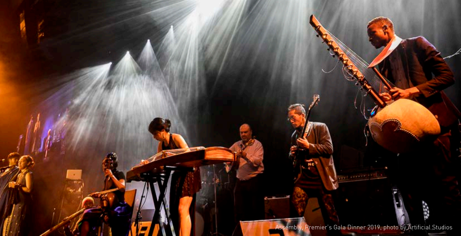
Assembly, Premier's Gala Dinner 2019