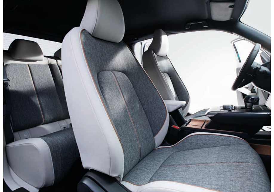
LIGHT GREY CLOTH WITH STONE LEATHERETTE