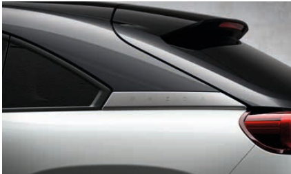
CERAMIC METALLIC PAINT WITH BRILLIANT BLACK ROOF AND GREY METALLIC UPPER SIDE PANELS