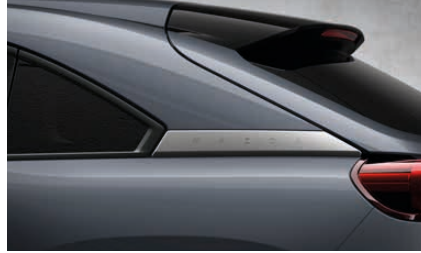
POLYMETAL GREY METALLIC PAINT