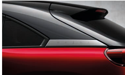
SOUL RED CRYSTAL METALLIC PAINT WITH BRILLIANT BLACK ROOF AND GREY METALLIC UPPER SIDE PANELS