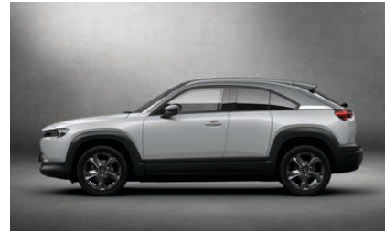
CERAMIC METALLIC PAINT WITH BRILLIANT BLACK ROOF AND GREY METALLIC UPPER SIDE PANELS