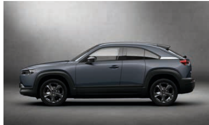
POLYMETAL GREY METALLIC PAINT