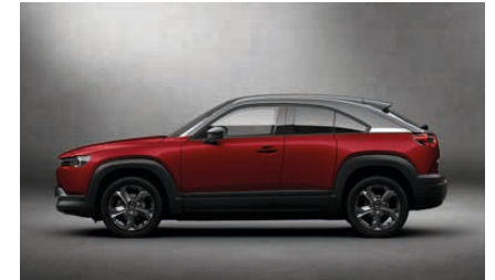
SOUL RED CRYSTAL METALLIC PAINT WITH BRILLIANT BLACK ROOF AND GREY METALLIC UPPER SIDE PANELS