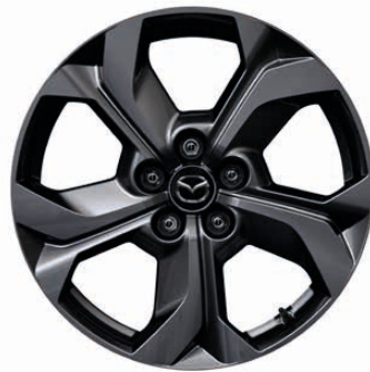
18" Bright Metallic Alloys (Available on Sport Lux, First Edition and GT Sport Tech grades)

*Mica/Metallic/Pearlescent/special paint available at additional cost. ^Polymetal Grey and Ceramic Metallic are free of charge on First Edition models only. ^^Not available on SE-L Lux grade.