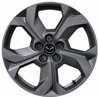
18" Silver Metallic Alloys (Available on SE-L Lux grade)