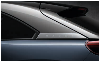
POLYMETAL GREY METALLIC WITH BRILLIANT BLACK ROOF AND SILVER METALLIC SIDE PANELS* ^^