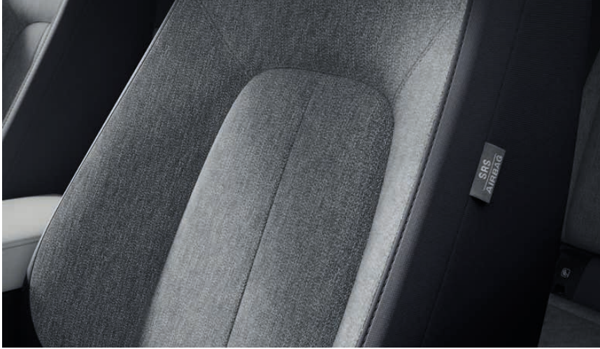
LIGHT GREY CLOTH WITH DARK GREY TRIM (Available on SE-L Lux grade)