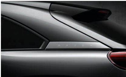
MACHINE GREY METALLIC*