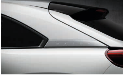
ARCTIC WHITE SOLID