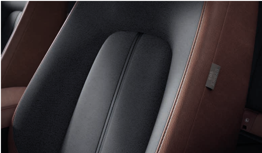
DARK GREY CLOTH WITH BROWN LEATHERETTE (Optional on GT Sport Tech grade)