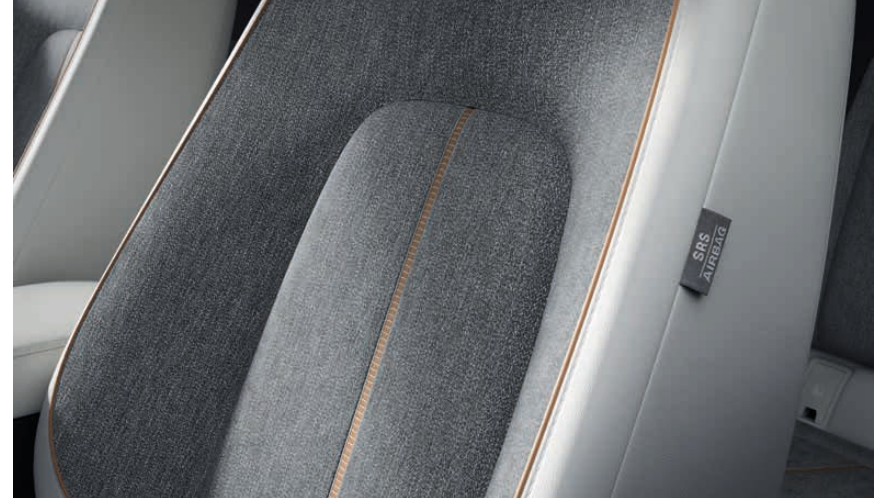
LIGHT GREY CLOTH WITH STONE LEATHERETTE (Available on Sport Lux, First Edition and GT Sport Tech grade)