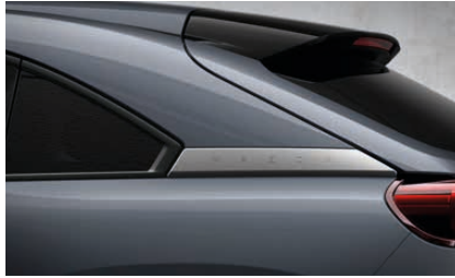
POLYMETAL GREY METALLIC*^