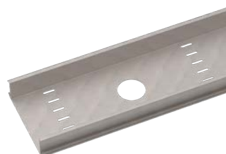
KSCCA-06-240 Ventilated Cable Channel with Pass Through Available in Q3 2022 Patent pending