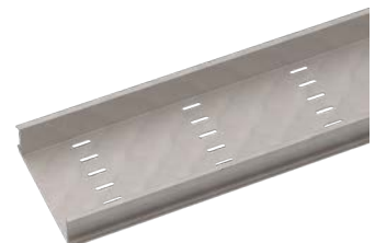
KSCCSA-06-240 Ventilated Cable Channel Patent pending