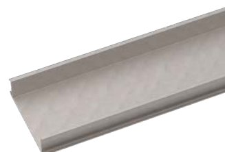
KSCCNA-06-240 Non-Ventilated Cable Channel Patent pending