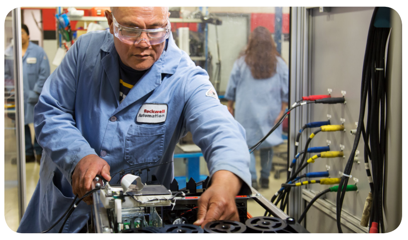
We restore your product so that it functions like new, to help extend the life of your Allen-Bradley equipment .

Reductions in maintenance staff and spare parts inventory often lead to longer downtime and lost revenue when your automation assets need replacement. To help minimize downtime and keep production lines running, you need a reliable service provider that you can trust to deliver quality repairs when you need them.