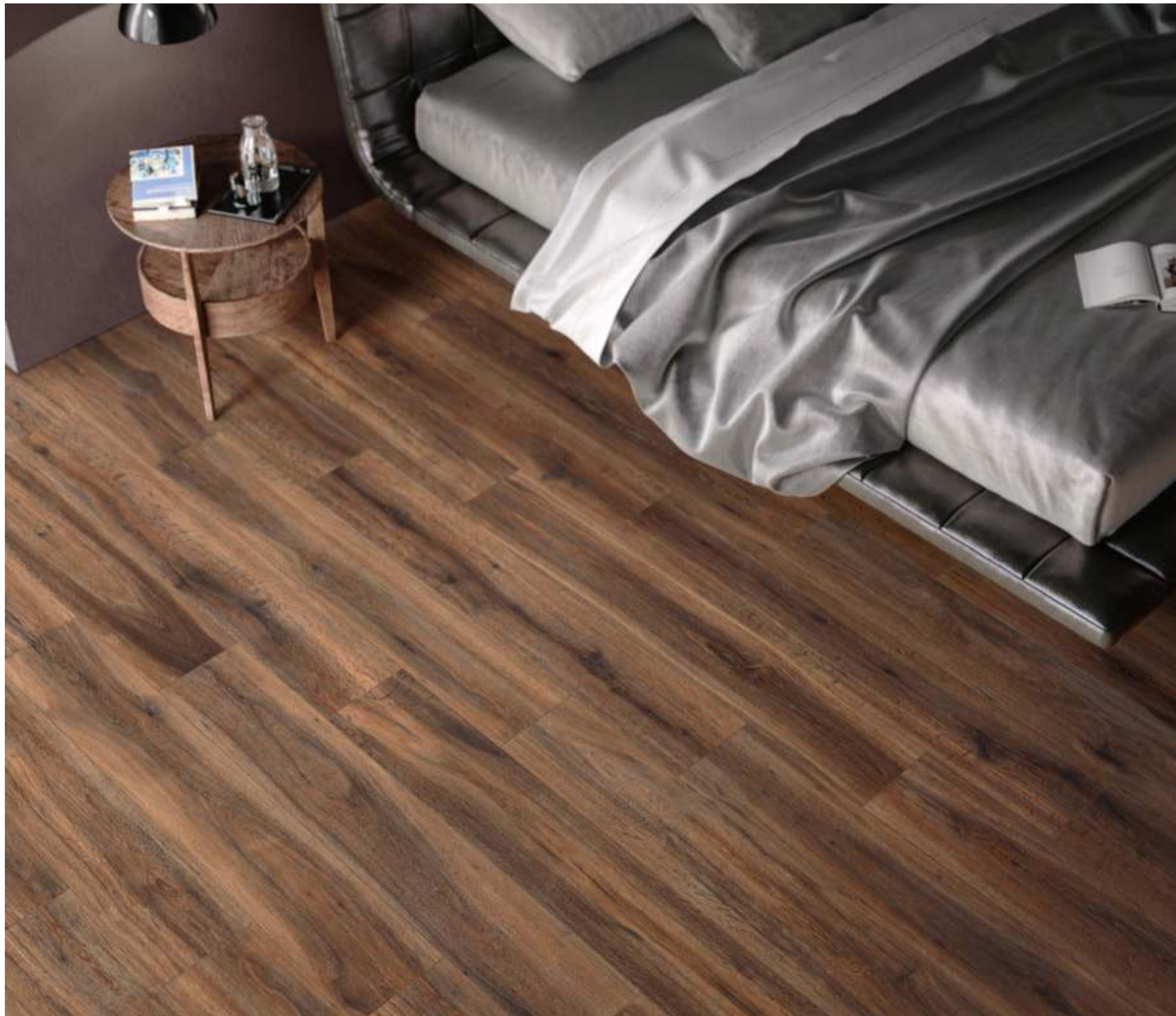
Barkwood Cherry 20120