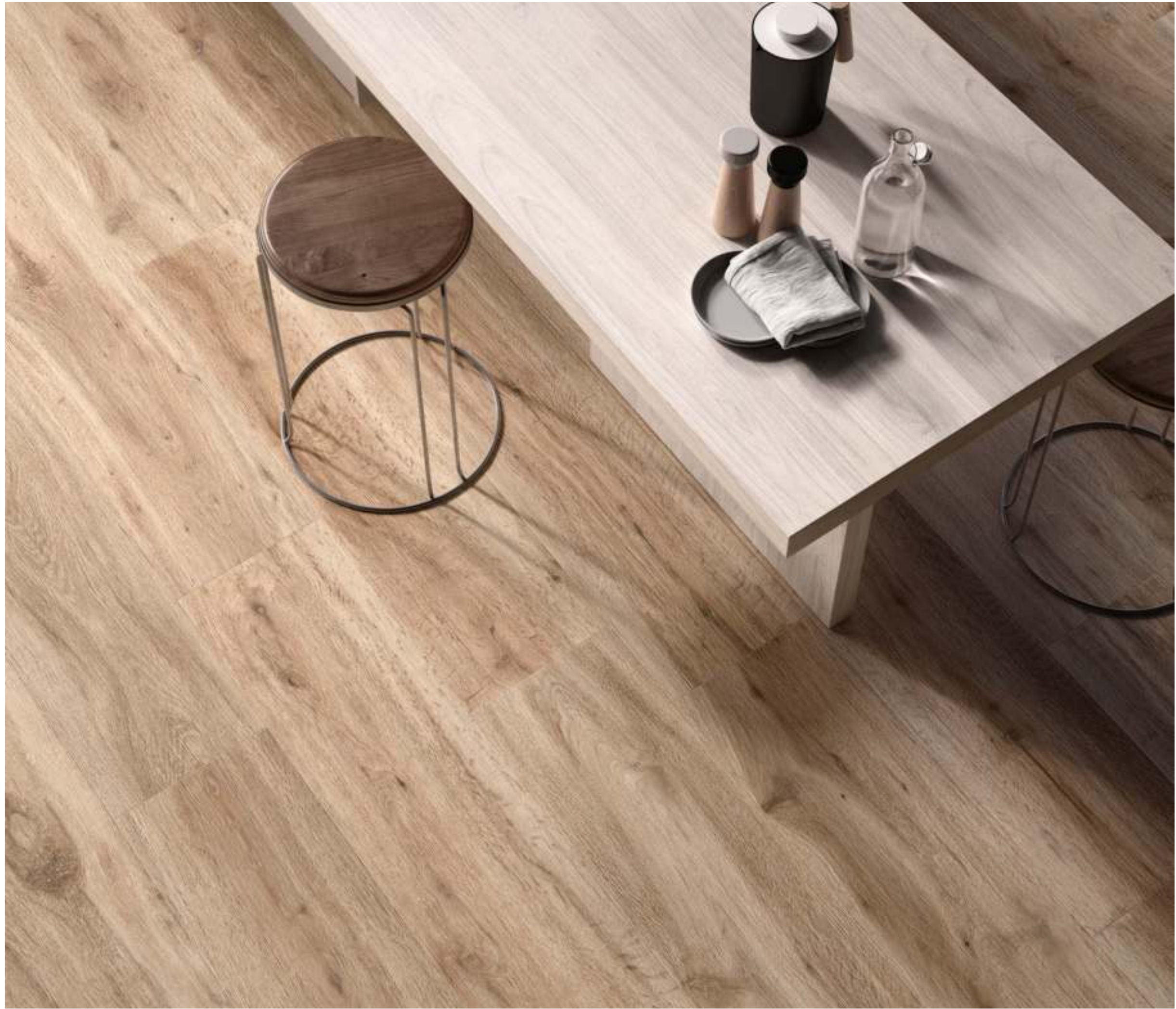
Barkwood Honey 30120