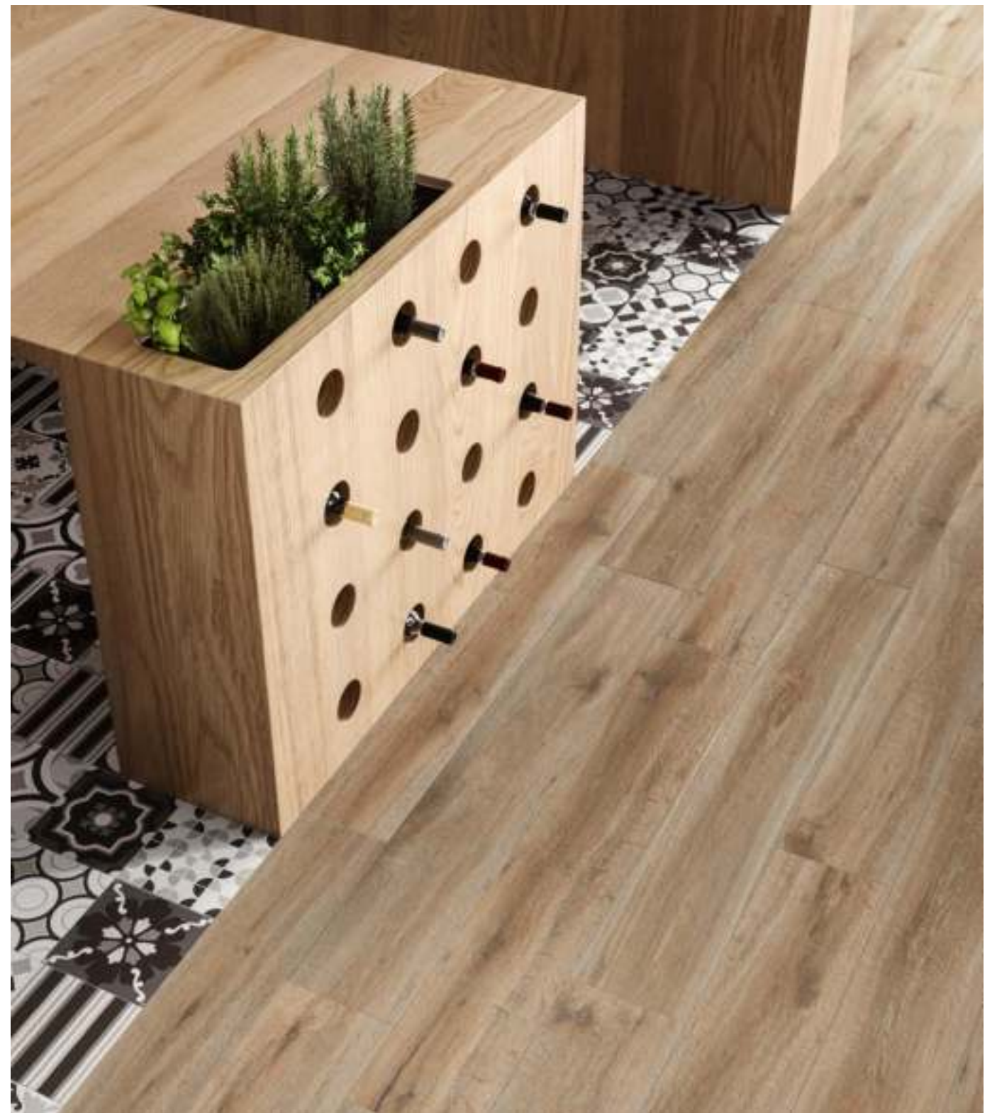
Barkwood Natural 20120