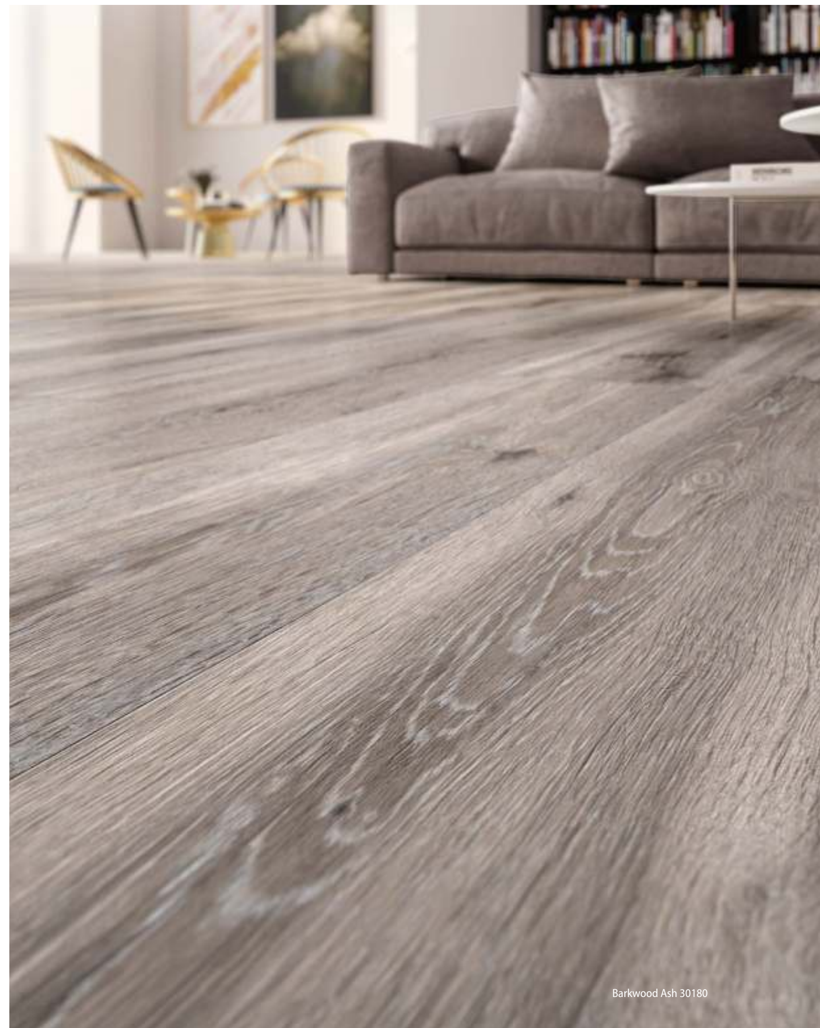
Barkwood Ash 30180

The large 30x180 size can make the most of material beauty and of the graphic and chromatic richness of BARKWOOD slabs. And this "great beauty", associated with the high technical performance of 1 cm - 2/5" thick porcelain, can satisfy the most demanding and qualified design and architecture, in particular for interior use, for large spaces in both the commercial and residential areas, public or private.