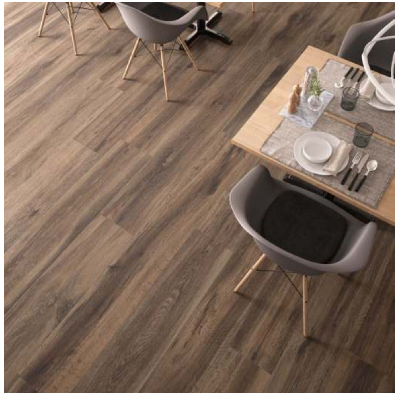
Barkwood Burnt 30180