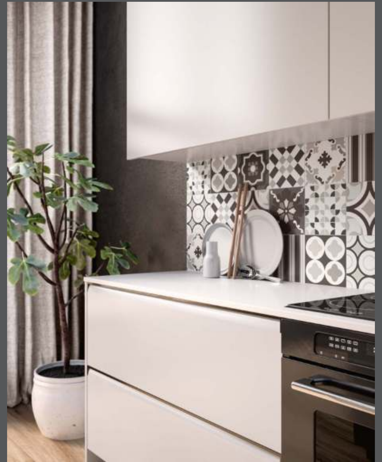
Barkwood Honey 30120