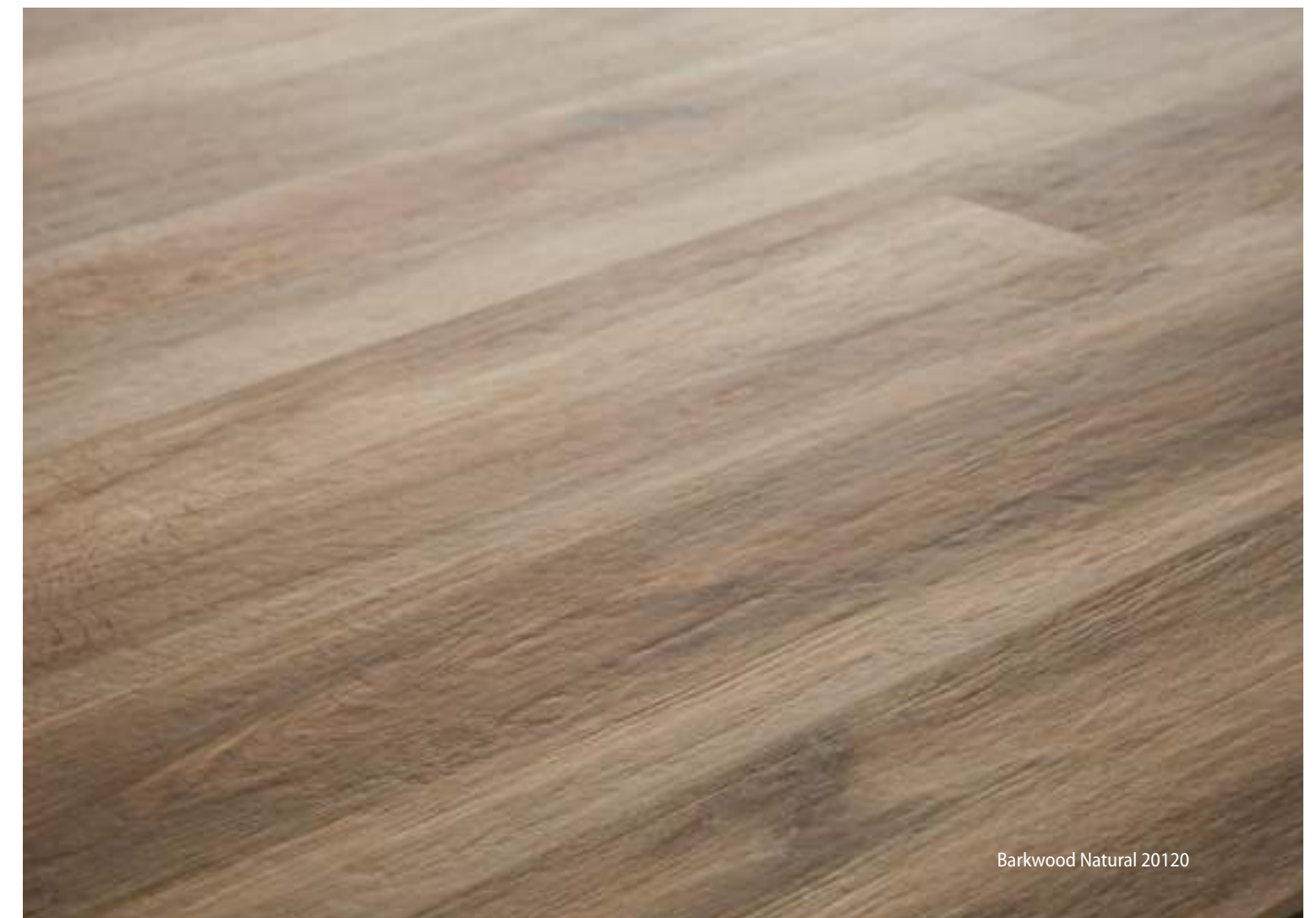
Barkwood Natural 20120