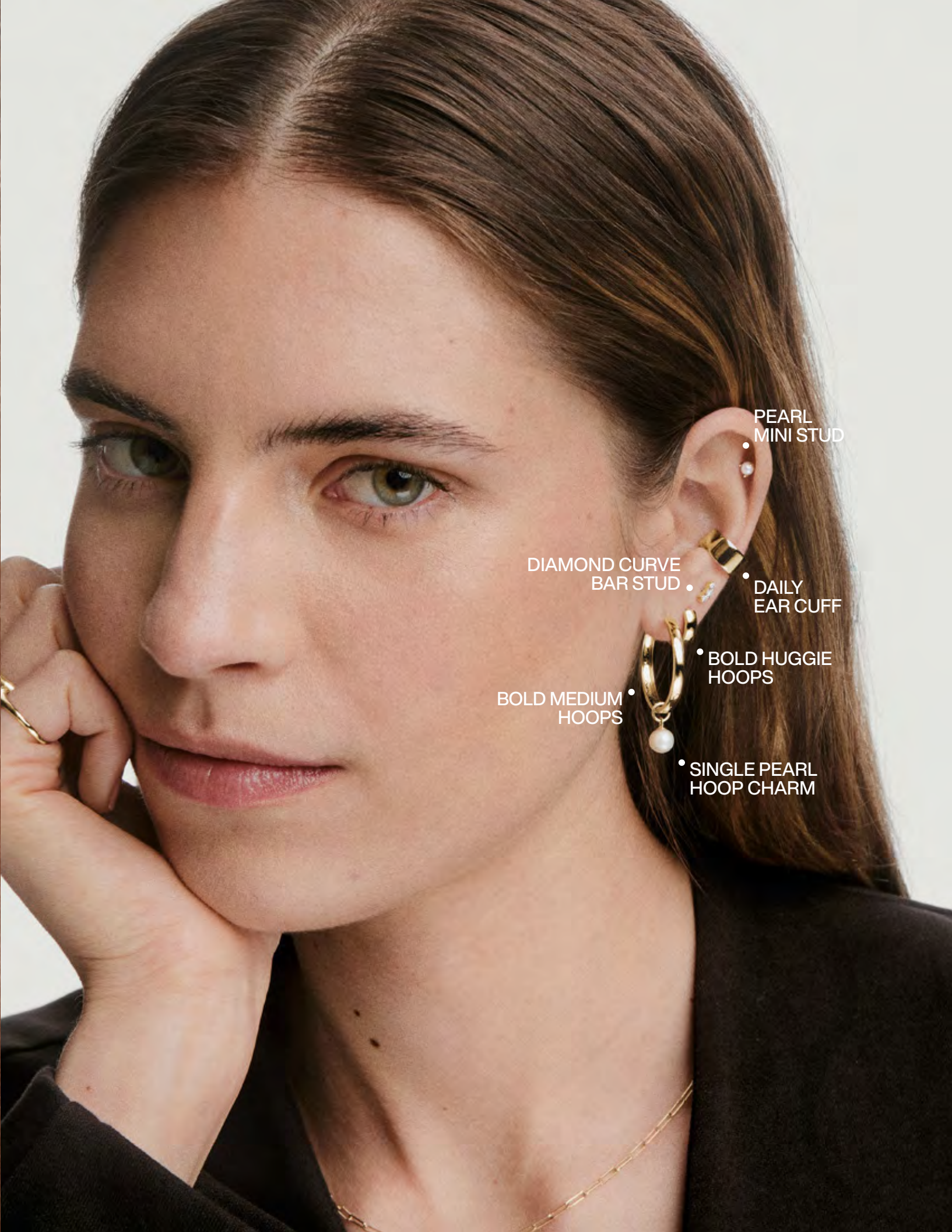
PEARL MINI STUD