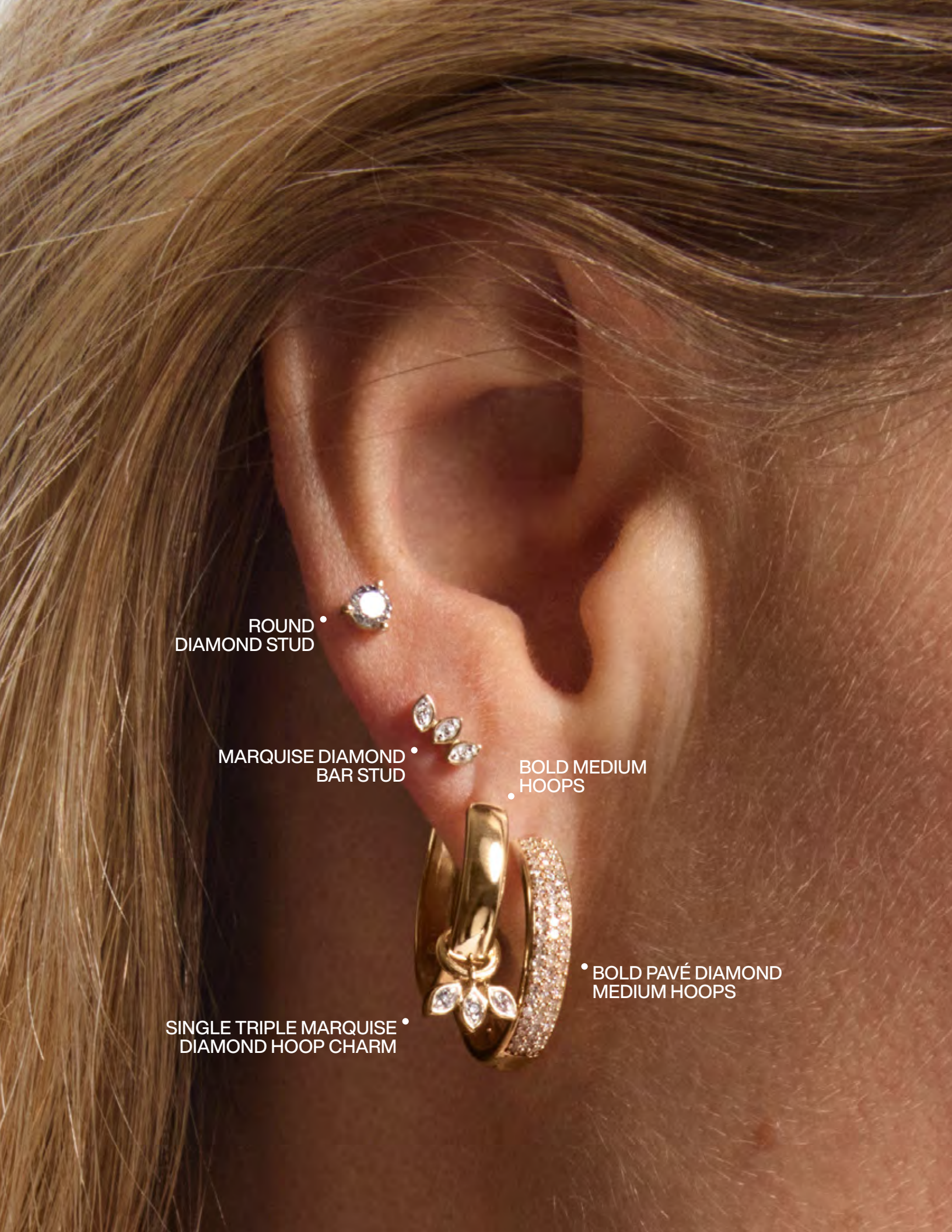
ROUND DIAMOND STUD