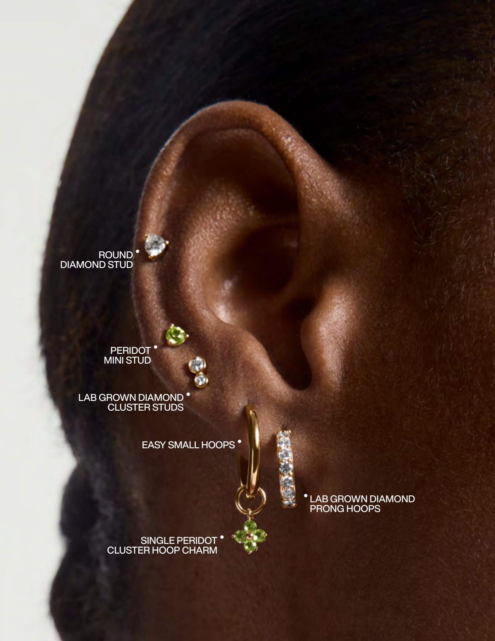
• ROUND DIAMOND STUD