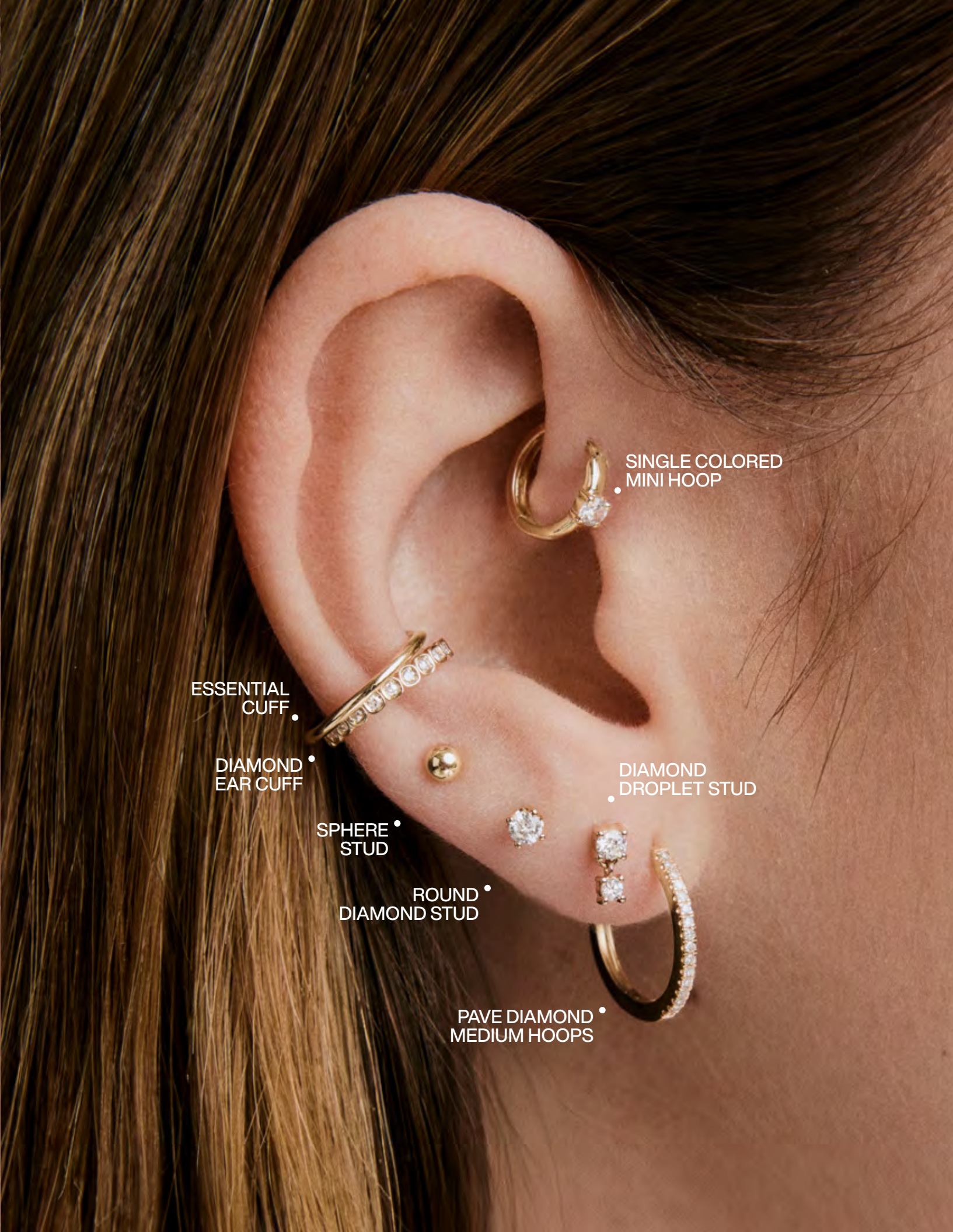
SINGLE COLORED MINI HOOP