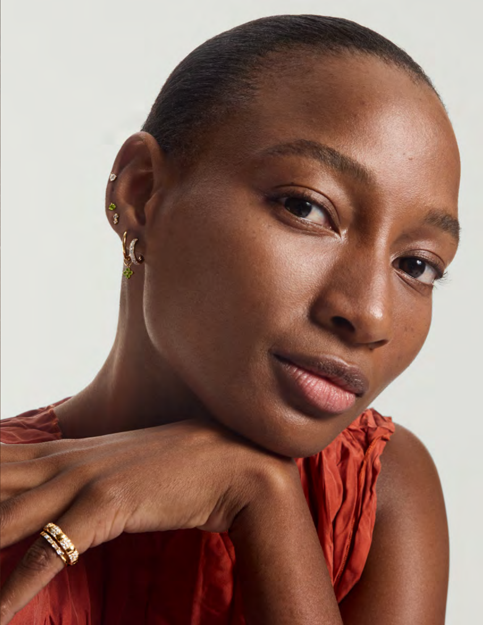
• LAB GROWN DIAMOND PRONG HOOPS