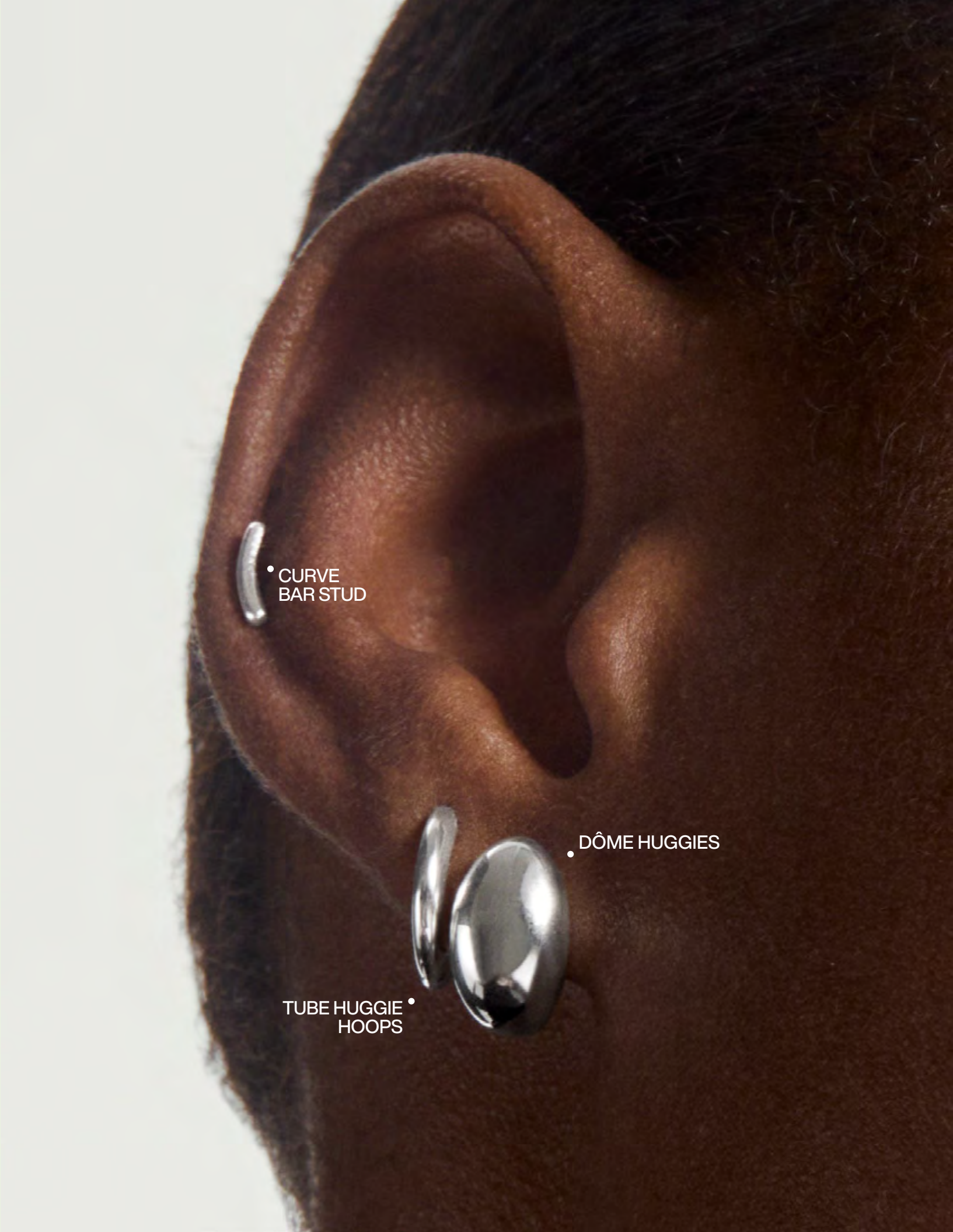
CURVE BAR STUD

A LITTLE GOES A LONG WAY. CREATE A STACK THAT DOESN'T TRY TOO HARD.