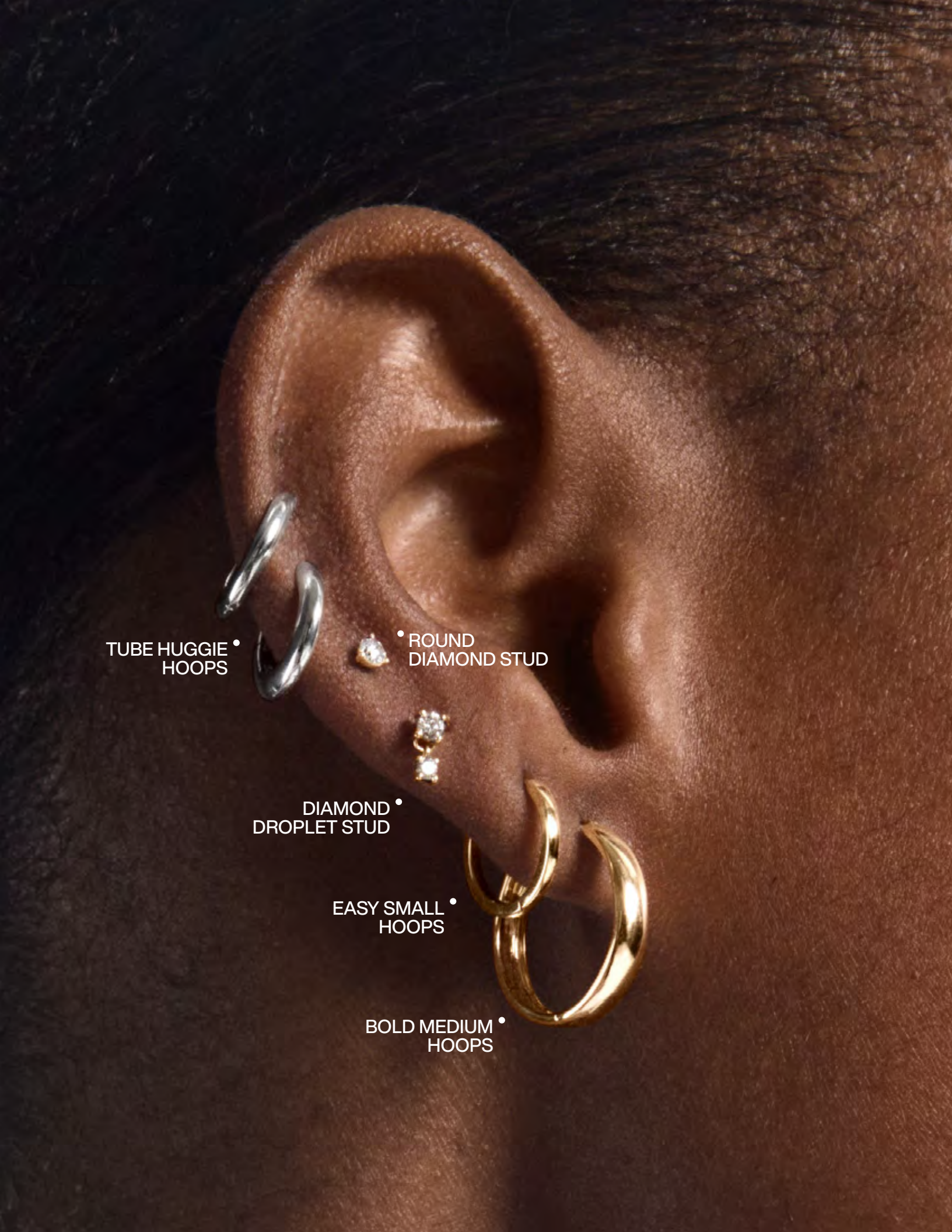
TUBE HUGGIE HOOPS