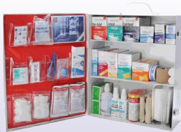
First Aid Kits