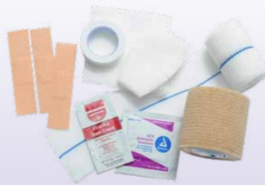
First Aid Supplies