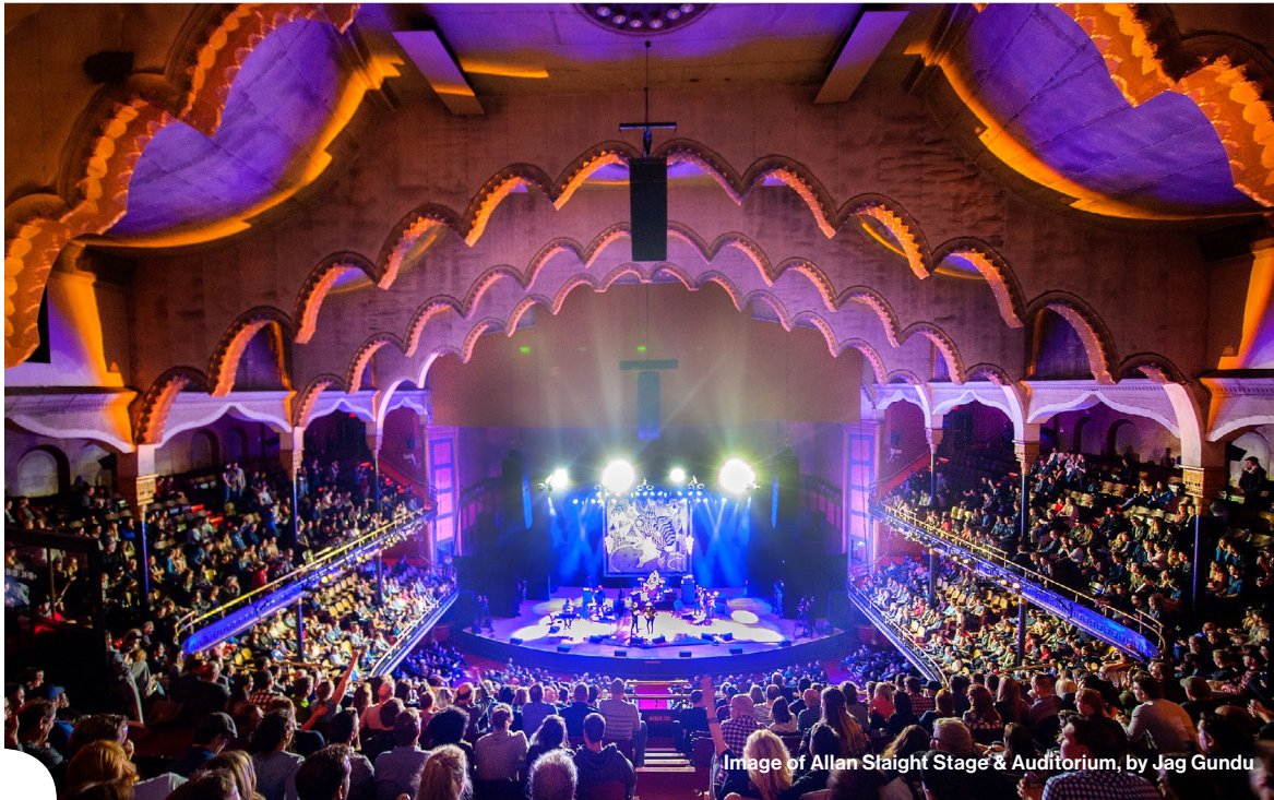
Image of Allan Slaight Stage & Auditorium

An aspirational home for our nation's great artists and iconic international entertainers, no other venue has contributed so much to our country's cultural identity. And now, you can leave a lasting legacy by adding your name to the Hall.