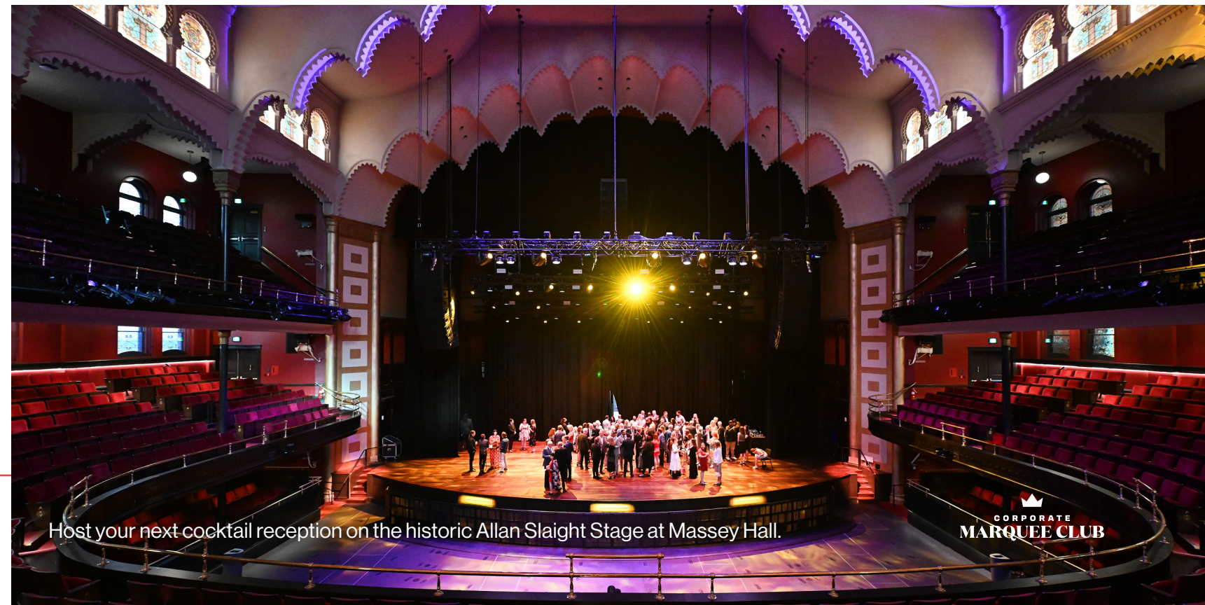
Host your next cocktail reception on the historic Allan Slaight Stage at Massey Hall.