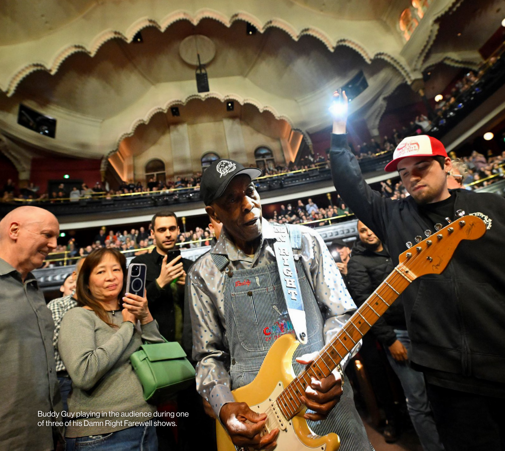
Buddy Guy playing in the audience during one of three of his Damn Right Farewell shows.