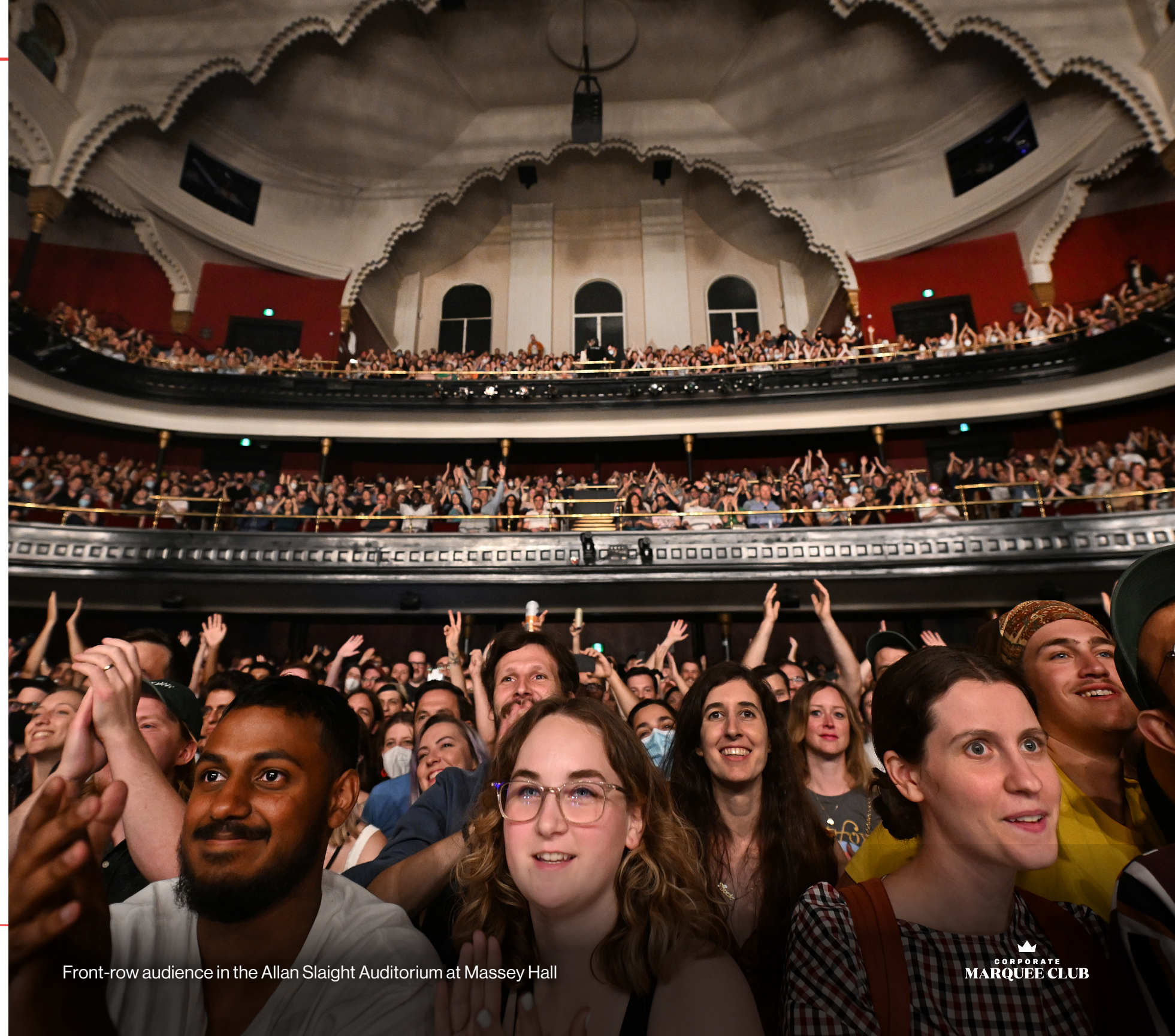
Front-row audience in the Allan Slaight Auditorium at Massey Hall