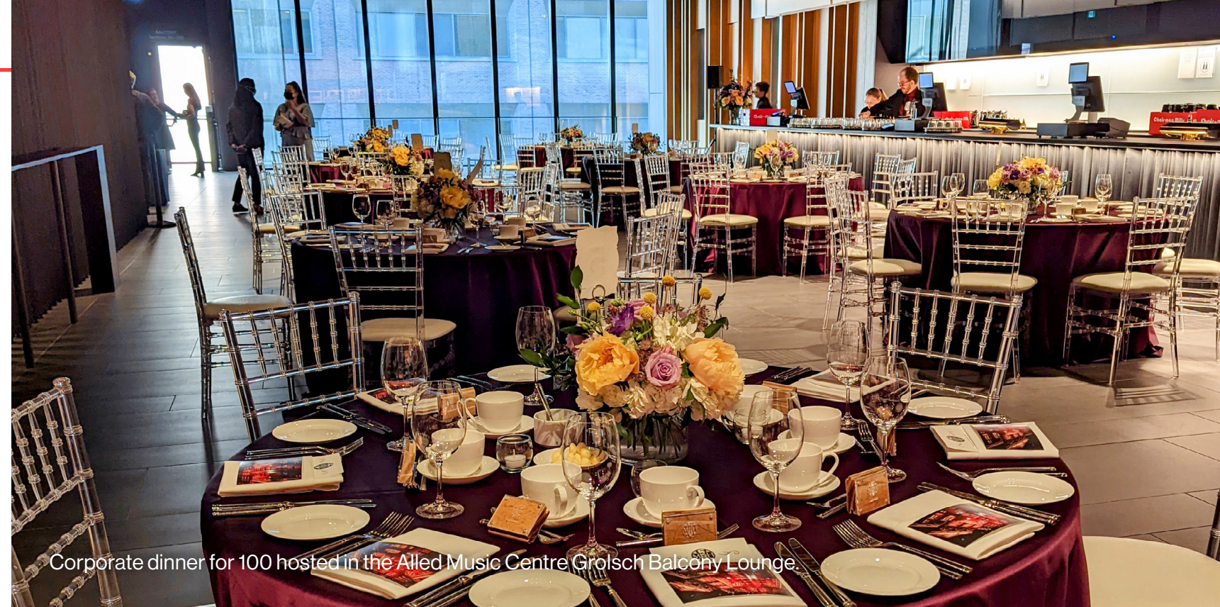
Corporate dinner for 100 hosted in the Allied Music Centre Grosch Balcony Lounge.

Whether it's the classical grandeur of Roy Thomson Hall, the historic and intimate atmosphere of Massey Hall, or the state-of-the-art facilities of TD Music Hall, with additional spaces opening soon, a Corporate Marquee Club membership allows you to offer clients a variety of unforgettable experiences while aligning your brand with our internationally renowned concert halls.