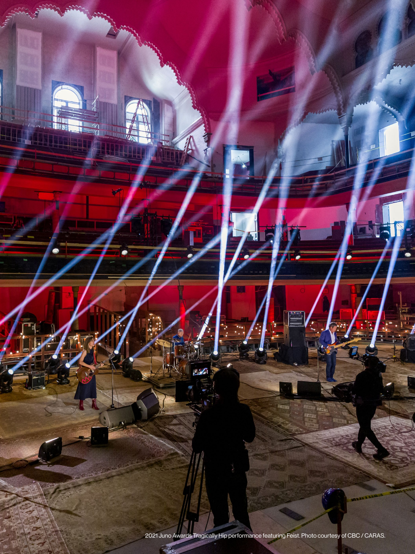
2021 Juno Awards Tragically Hip performance featuring Feist.