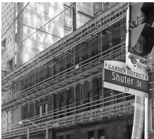
East Passerelle Construction in Progress, Massey Hall Photo: Salina Kassam, November 2020.