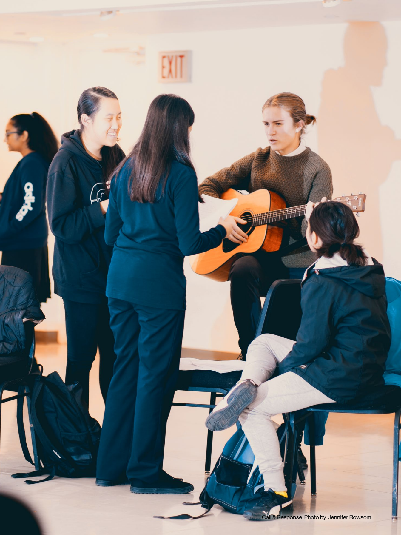
Call & Response.