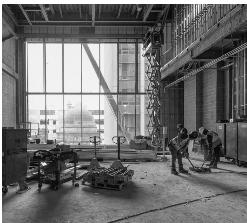
4th Floor Club Construction in Progress, Allied Music Centre Photo: Salina Kassam, September 2020