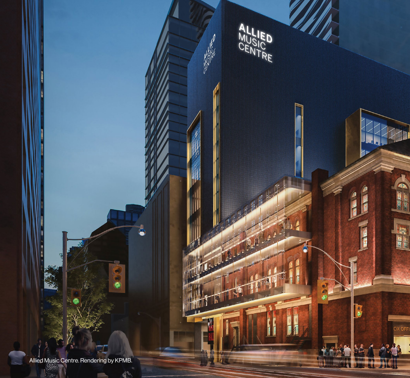
Allied Music Centre. Rendering by KPMB.