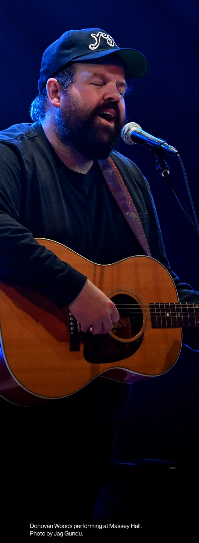
Donovan Woods performing at Massey Hall.