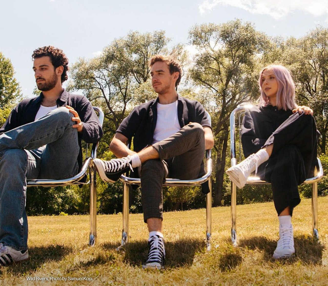
Wild Rivers

To help promote new releases from artists we have helped with the production, launch of videos and promotional materials like photoshoots and press kits, direct-to-fan engagement, and live video recordings including acoustic sessions.