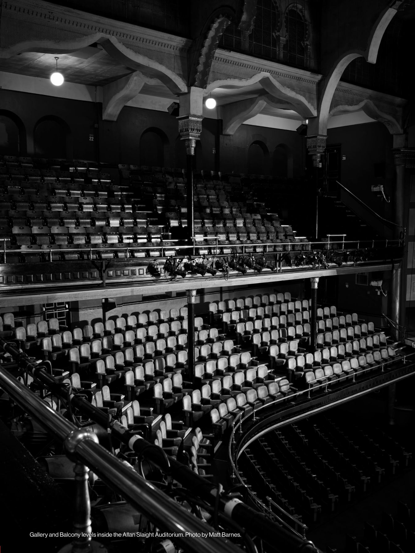
Gallery and Balcony levels inside the Allan Slaight Auditorium.