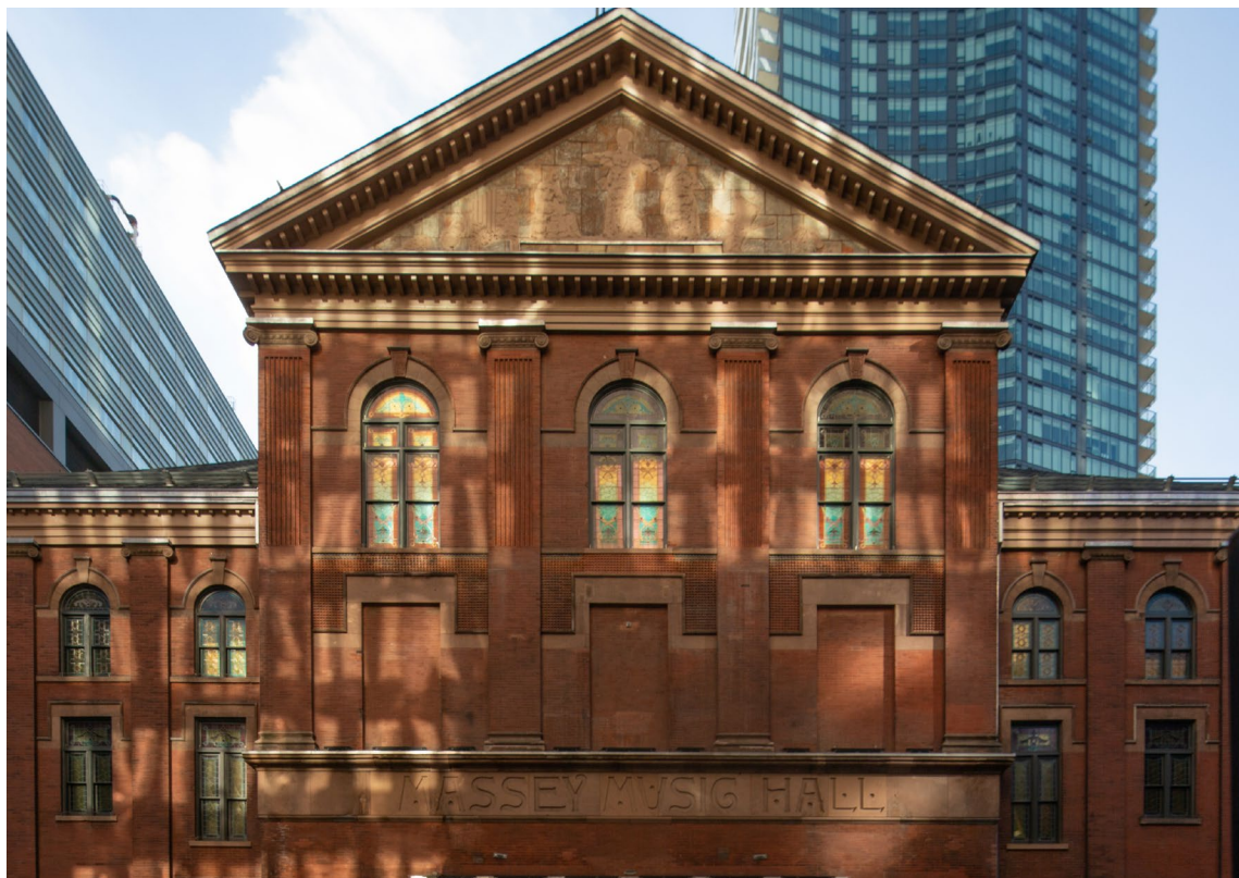
Front facade of Massey Hall.

We would like to acknowledge the significant work of our architect KPMB, contractor EllisDon, and our design team for their continued work in making the Massey Hall Revitalization project a reality.