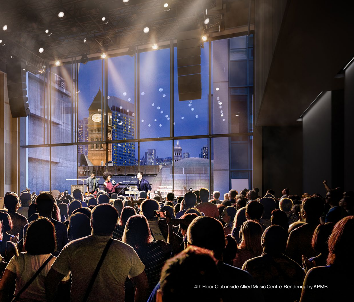
4th Floor Club inside Allied Music Centre. Rendering by KPMB.