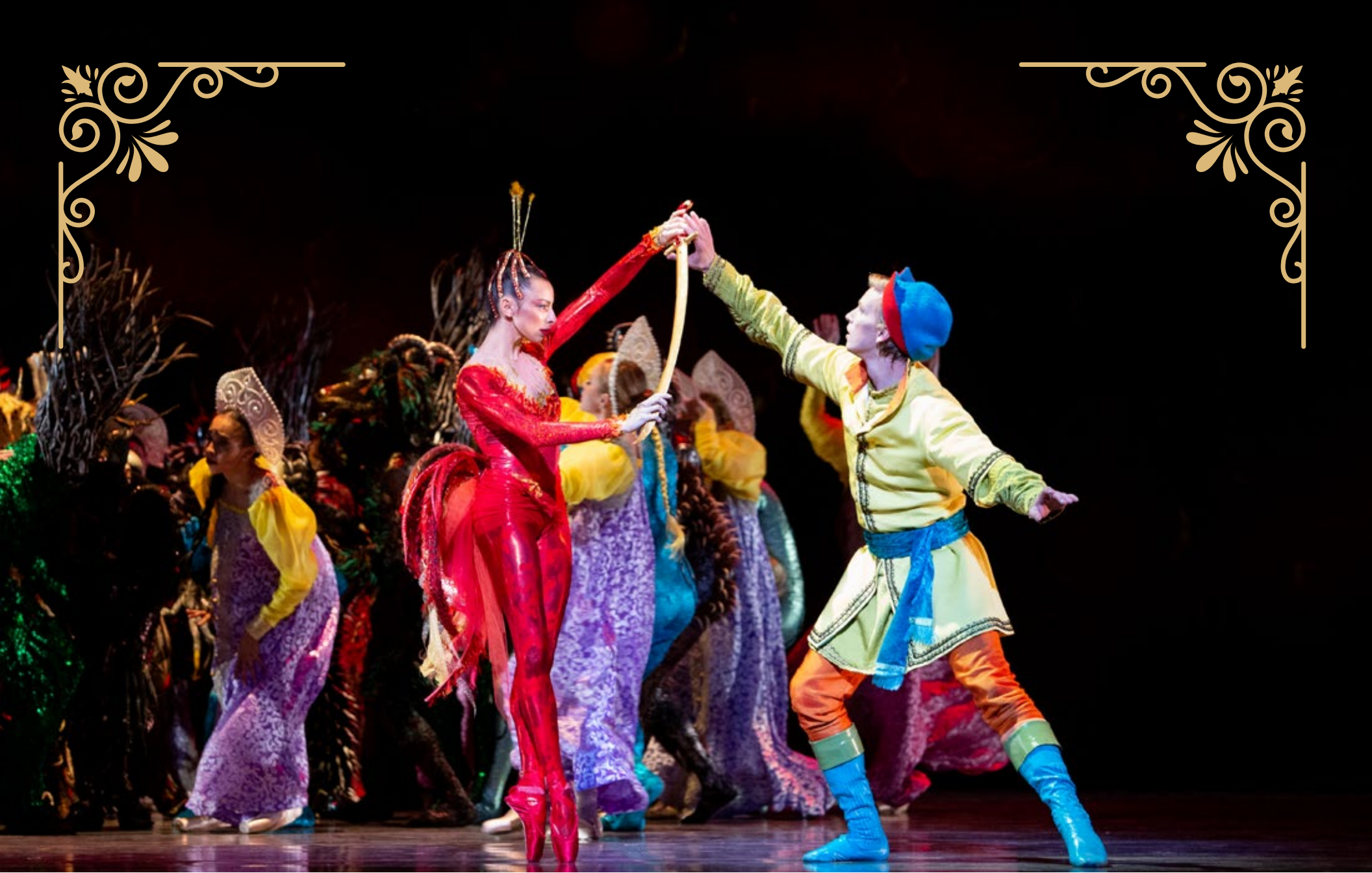
The Firebird appears, and gives Ivan a sword which he uses to fight.