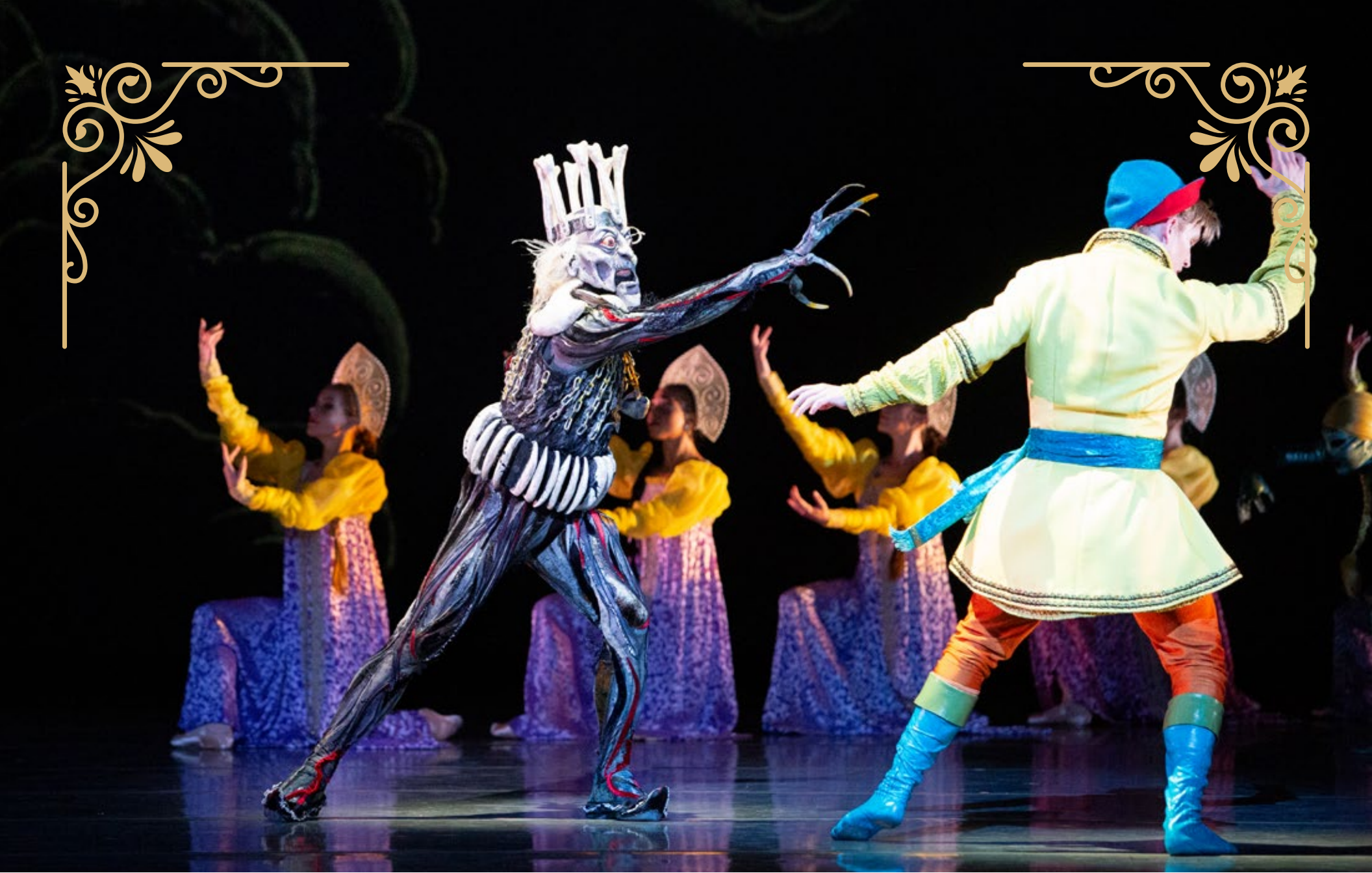
The ominous figure of Kastchei appears, and casts a dark and powerful spell that forces Ivan to dance the “infernal dance” to his death.