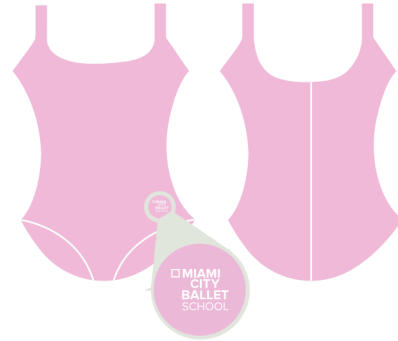
PRE-BALLET Light Pink