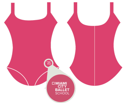
BALLET PREP III Rose