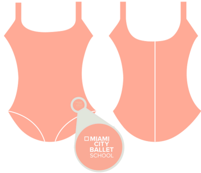
CREATIVE MOVEMENT Peach