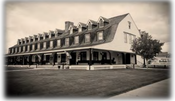
A National Historic Landmark.