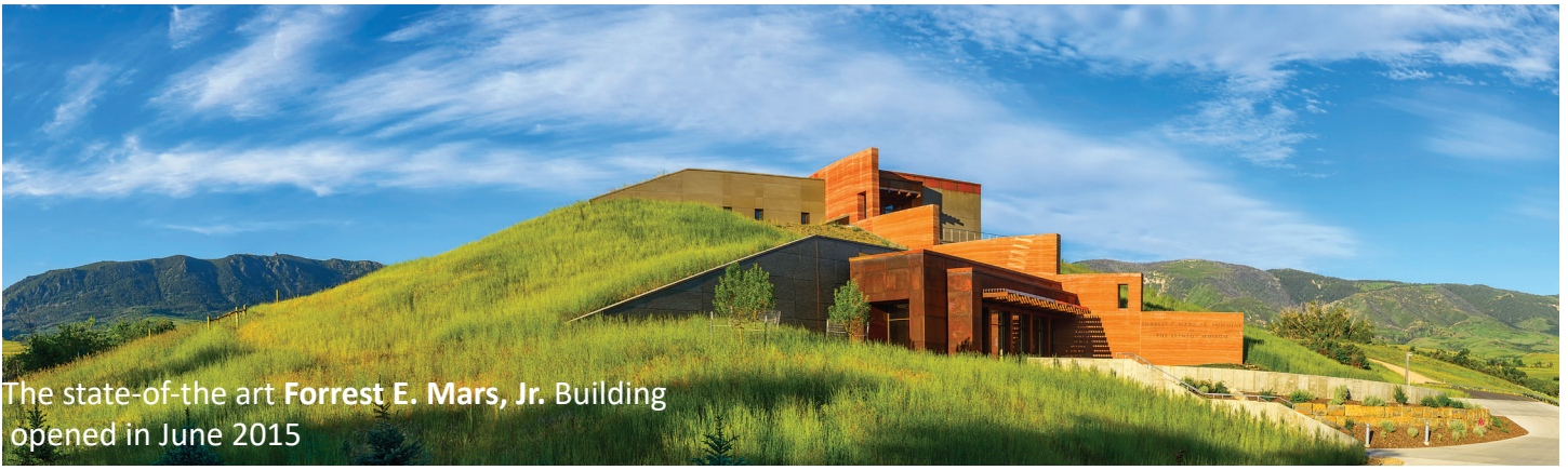
The state-of-the art Forrest E. Mars, Jr. Building opened in June 2015