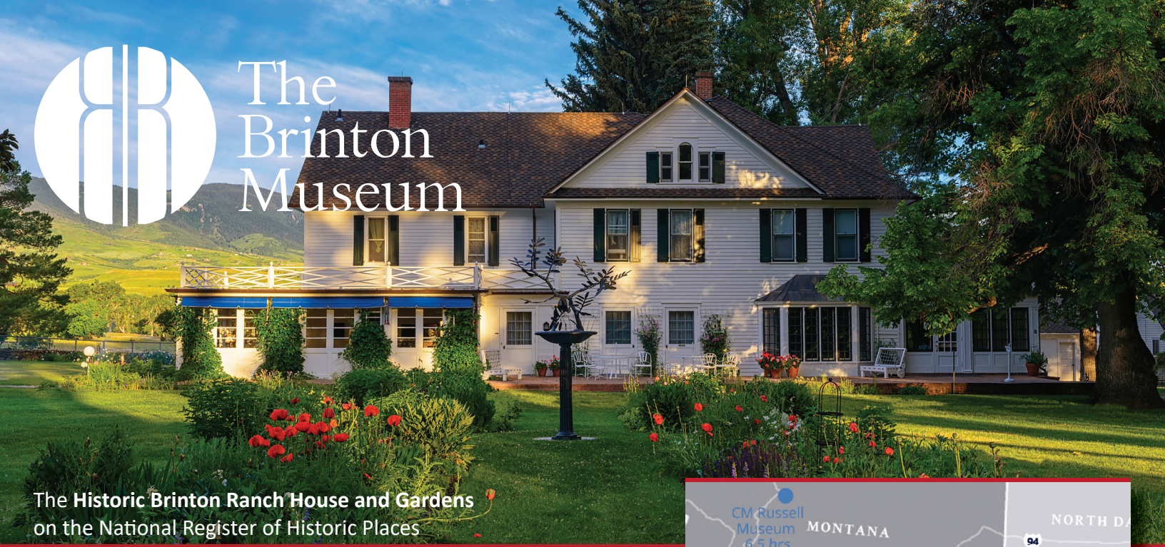
The Historic Brinton Ranch House and Gardens on the National Register of Historic Places