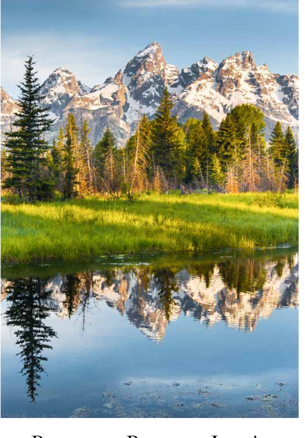
Preserve · Protect · Inspire Grand Teton National Park