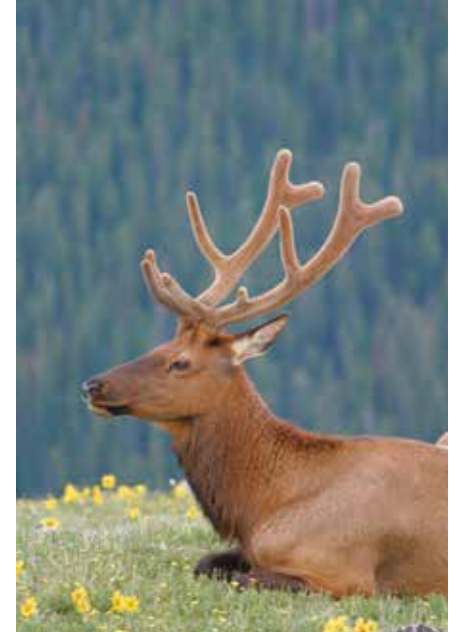
Open mid-May through early October

historic Jackson Lake Lodge, or the rustically elegant Jenny Lake Lodge. If you're looking for the perfect family camping adventure, Colter Bay Village provides a choice of log cabins, tent cabins, and RV Park, or choose from one of our three campgrounds located throughout the park.