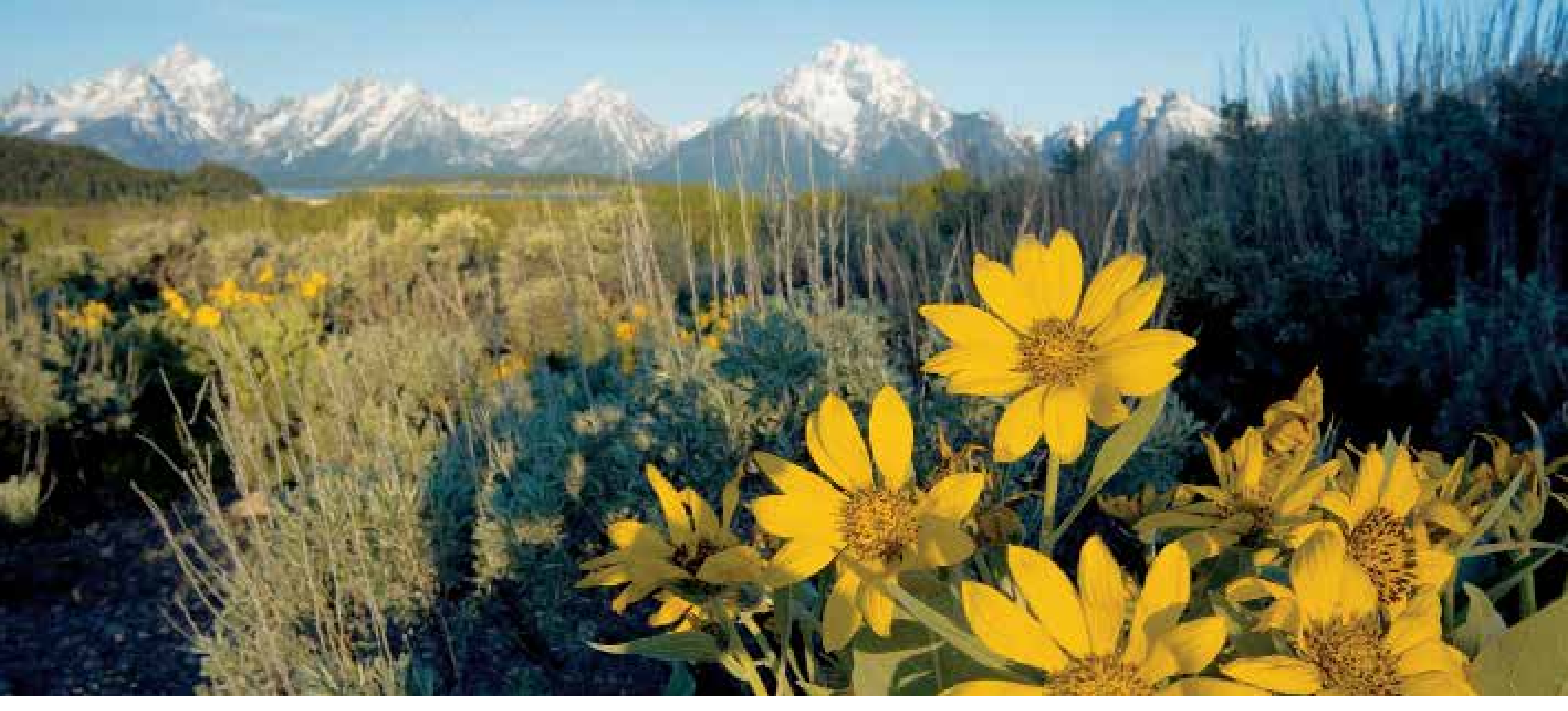
The Tetons beckon the spirit of adventure in us all.