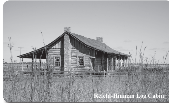
Refeld-Hinman Log Cabin