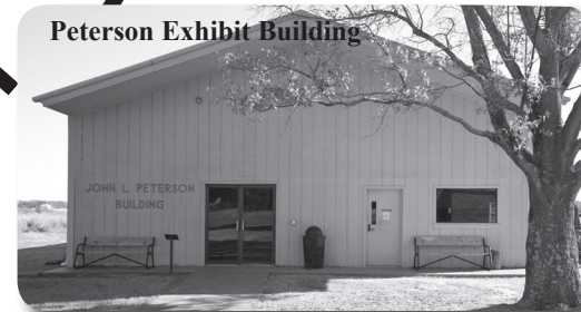
Peterson Exhibit Building