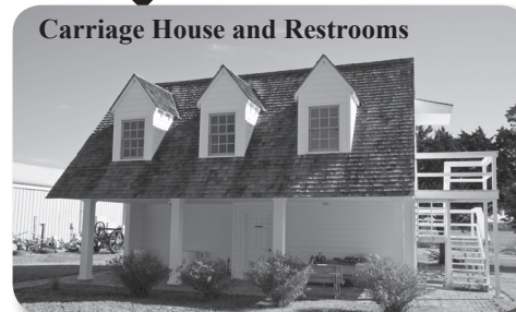
Carriage House and Restrooms