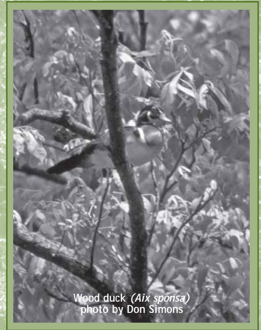
Wood duck ( Aix sponsa )

Arkansas Department of Parks & Tourism #1 Capitol Mall Little Rock, AR 72201 1-888-AT-PARKS