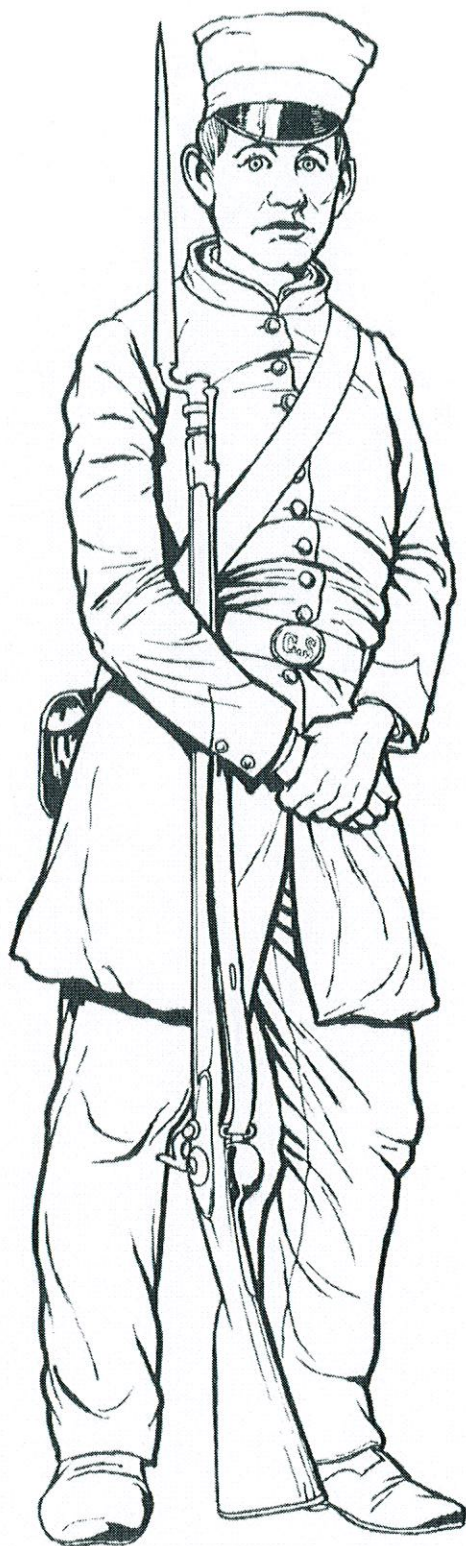
16. Private, City Guards Company of Arkansas, C.S. Army, 1861. The uniform of this young volunteer from Arkansas is both neat and sensible. His cap is dark blue with a white band. His coat is gray with white collar and cuffs. His buttons are brass, as is his Confederate belt plate. His belts are white and his cartridge box and shoes are of black leather. His trousers are dark blue, and his musket sling is white.