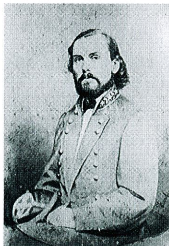
MAJOR GENERAL THOMAS C. HINDMAN

I THREATENE THE ENE AT 6 11 22 20 10 12 11 10 9 10 21 11 22 10 10 9 10 17 25 12 11 ANE HILL; THEN T P SITI N 7 12 9 10 22 6 18 18 11 22 10 9 11 15 15 13 8 15 4 6 11 6 15 9 AT PRAIRIE GR E AN GHT 12 11 8 20 12 6 20 6 10 3 20 15 16 10 12 9 21 23 15 2 3 22 11 THE H LE AR E H L THE 11 22 10 26 22 15 18 10 12 20 17 25 26 10 22 15 18 21 11 22 10 ATTLE IEL A LAG HAS THIS 24 12 11 11 18 10 23 6 10 18 21 12 23 18 12 3 22 12 4 11 22 6 4 ENT EEN SENT IN AS ING 17 15 17 10 9 11 24 10 10 9 4 10 9 11 6 9 12 4 13 6 9 3 A TR E TEL E H RS T 12 11 20 2 7 10 15 23 11 26 10 18 16 10 22 15 2 20 4 11 15 R THE EA AN ARE R 24 2 20 25 11 22 10 21 10 12 21 12 9 21 7 12 20 10 23 15 20 THE N E I HA E GRANTE 11 22 10 26 15 2 9 21 10 21 6 22 12 16 10 3 20 12 9 11 10 21 IT T HIN AN 6 11 11 7 22 6 9 21 17 12 9