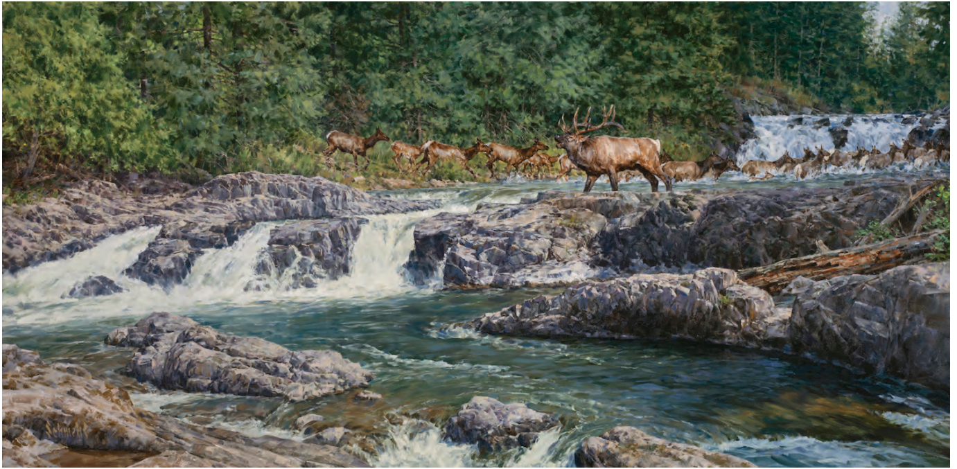
Bradley Schmehl, Patriarch , oil on canvas, 24 x 48 inches, $18,200