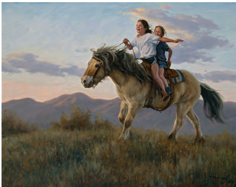
Spread Your Wings , oil on linen, 22 x 28 inches, $8,000