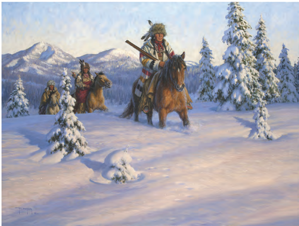
The Buried Trail , oil on linen, 30 x 40 inches, $22,500