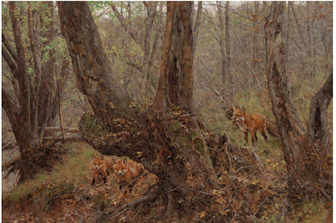
Bradley Schmehl, Secrets of the Forest , oil on canvas, 24 x 36 inches, $10,500