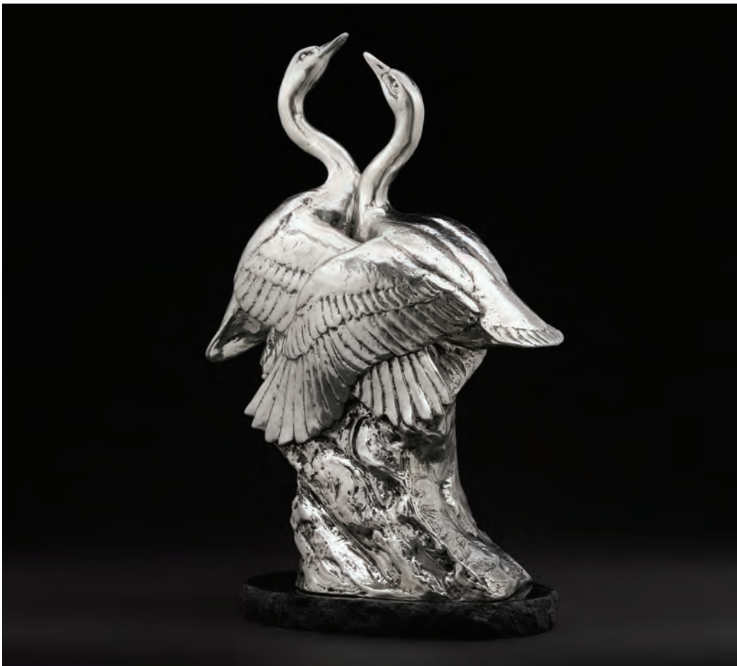
Kent Ullberg, Bonding , stainless steel, ed. of 12, 21 x 13 1/2 x 7 inches, $12,000