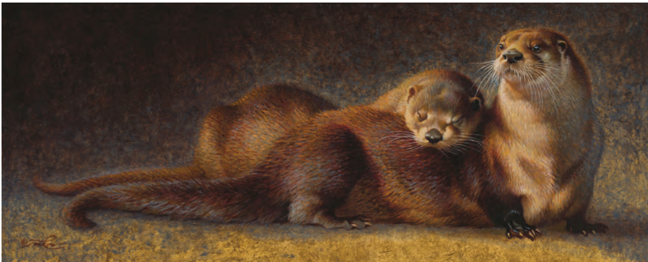
Ezra Tucker, Cozy Companions , acrylic on board, 12 x 30 inches, $12,000