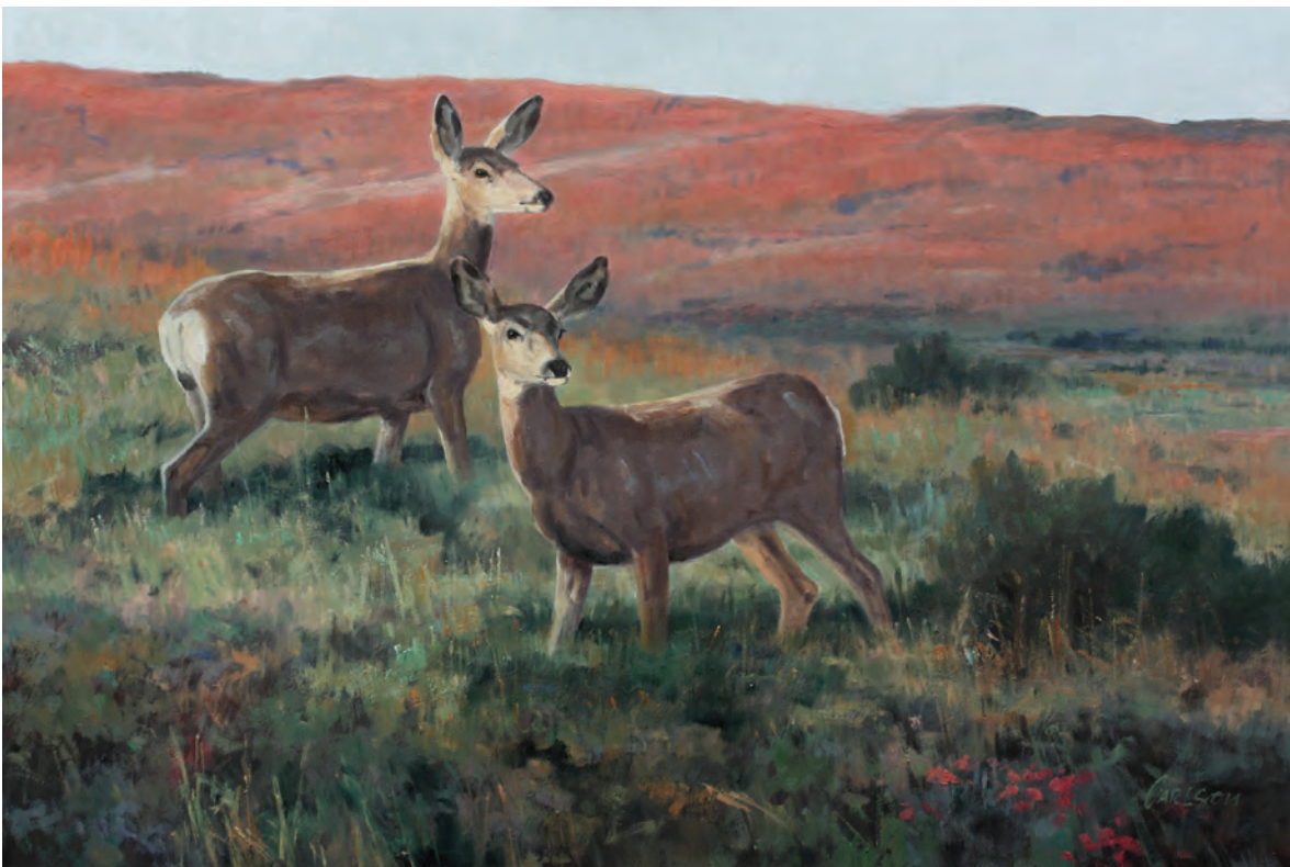
Ken Carlson, Coral Ridge - Mule Deer , oil on board, 20 x 30 inches, $28,000