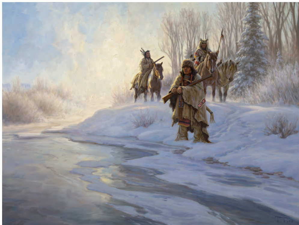
Iced Over , oil on linen, 36 x 48 inches, $29,500