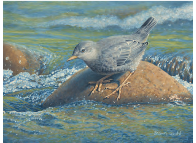
Shawn Gould, Little Dipper , acrylic on board, 9 x 12 inches, $950