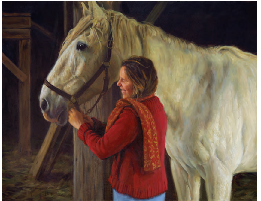
A Sturdy Partner , oil on linen, 22 x 28 inches, $8,000

MARCH 4 - MARCH 16, 2019 Open House: Saturday, March 16, 4-6pm