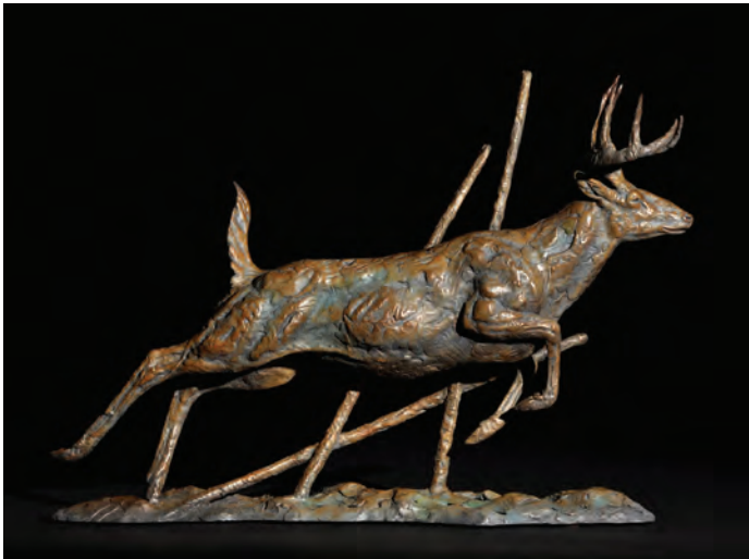
Mick Doellinger, Out of Nowhere , bronze ed. of 25, 19 ½ x 28 x 9 inches, $5,300