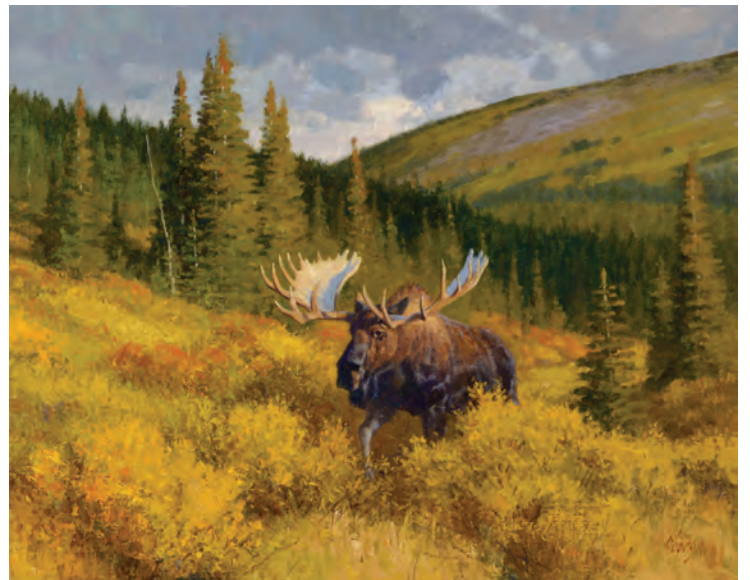
Ralph Oberg, Coming Through the Willows , oil on mounted linen, 24 x 30 inches, $11,500