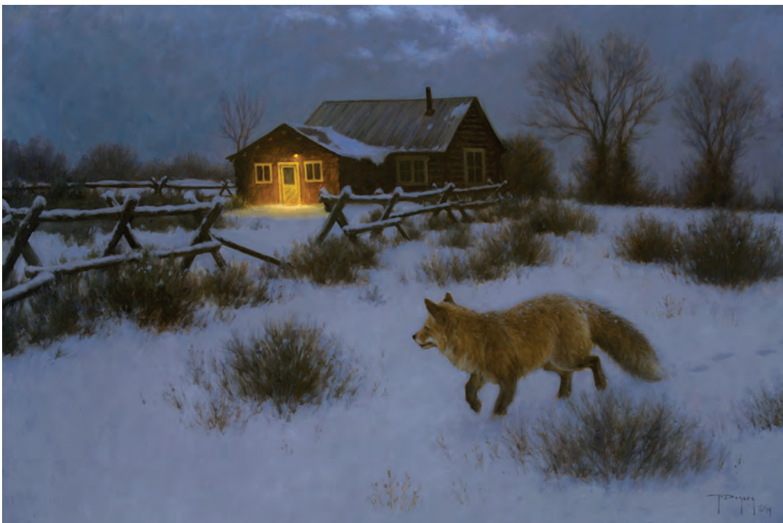
Silent Passing , oil on linen, 24 x 36 inches, $10,500