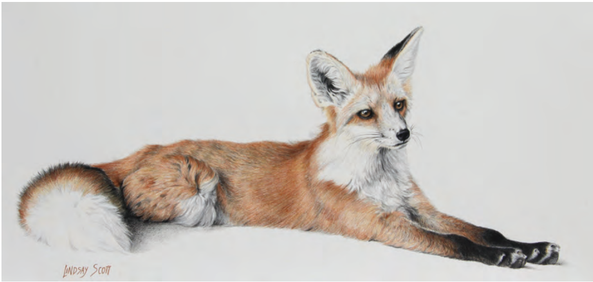
Lindsay Scott, Cool Red , colored pencil, 11 ½ x 25 inches, $7,500