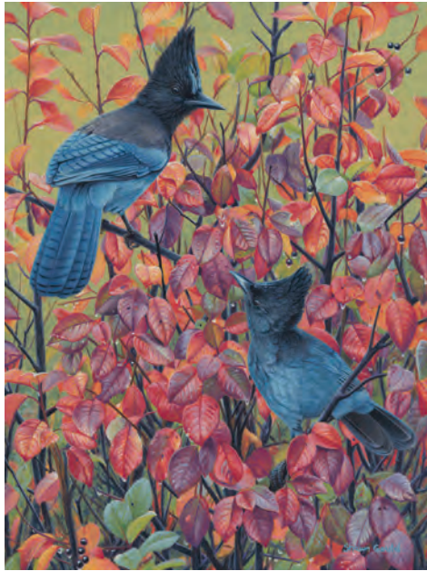
Shawn Gould Stellar Delight acrylic on board, 16 x 12 inches $1,600