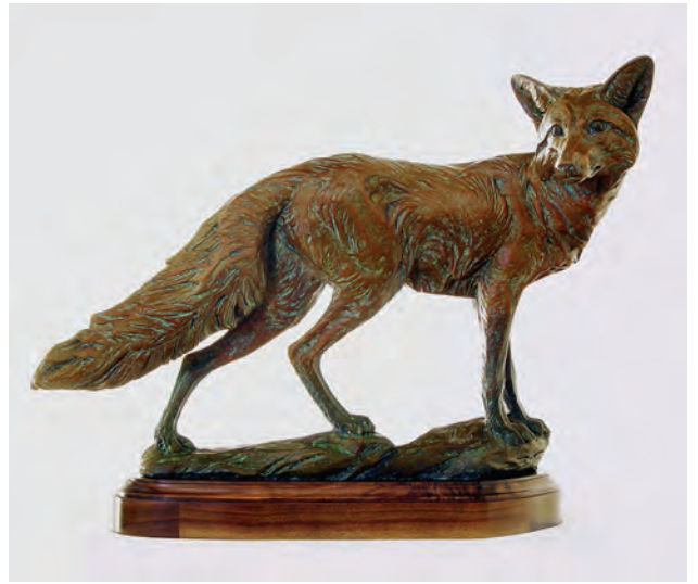
Margery Torrey, Hark , bronze ed. of 35, 20 ½ x 29 x 10 inches, $8,500