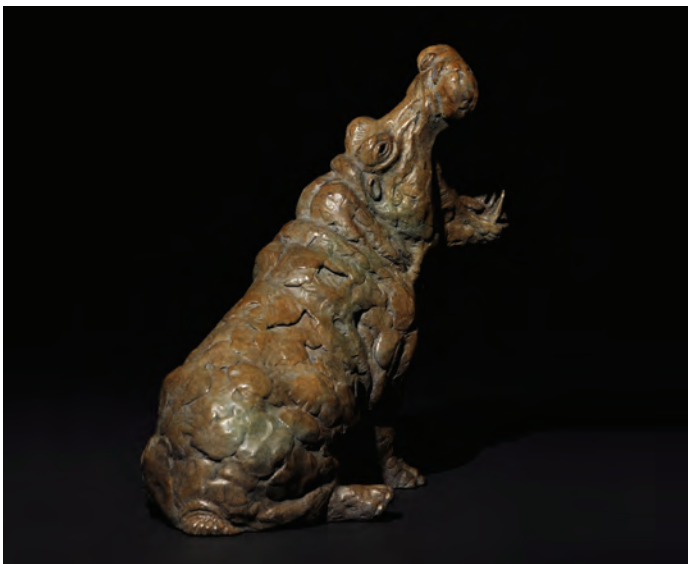
Mick Doellinger, Loud Mouth , bronze ed. of 30, 12 ½ x 13 ½ x 7 inches, $3,300