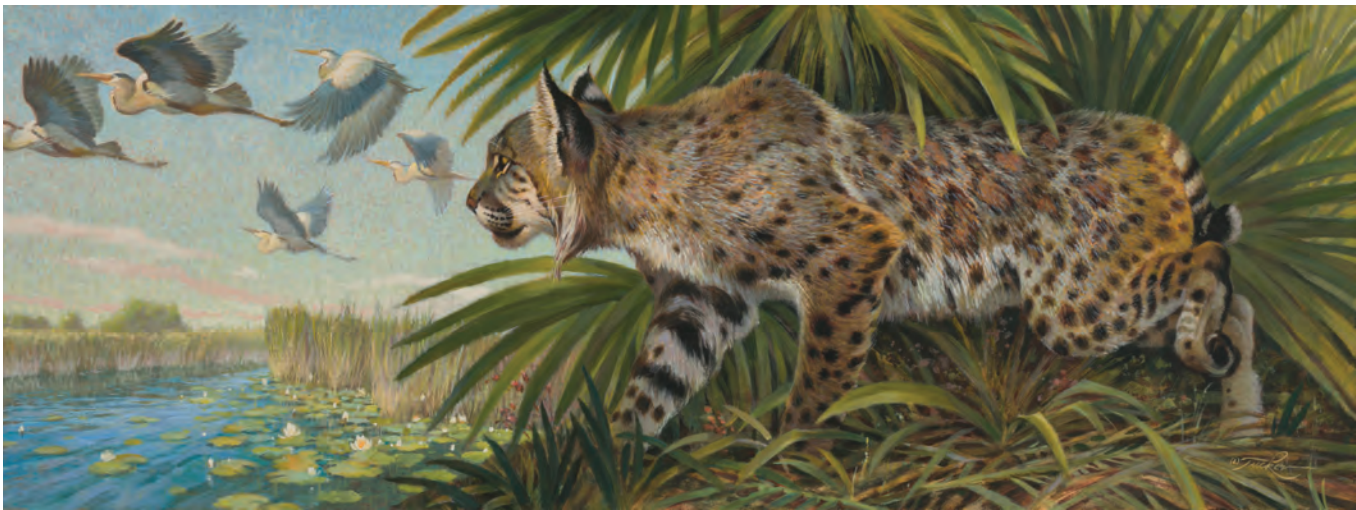
Ezra Tucker, Peeping Tom , acrylic on board, 15 x 40 inches, $18,000