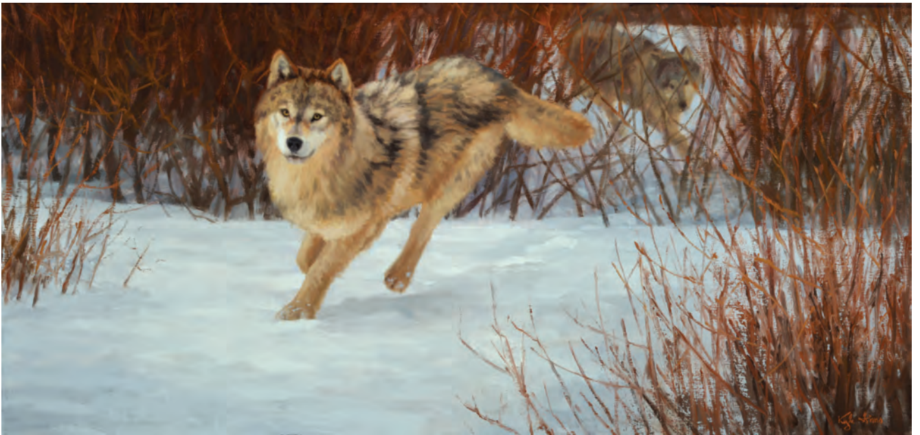
Kyle Sims, Willow Run , oil on canvas, 18 x 38 inches, $9,500