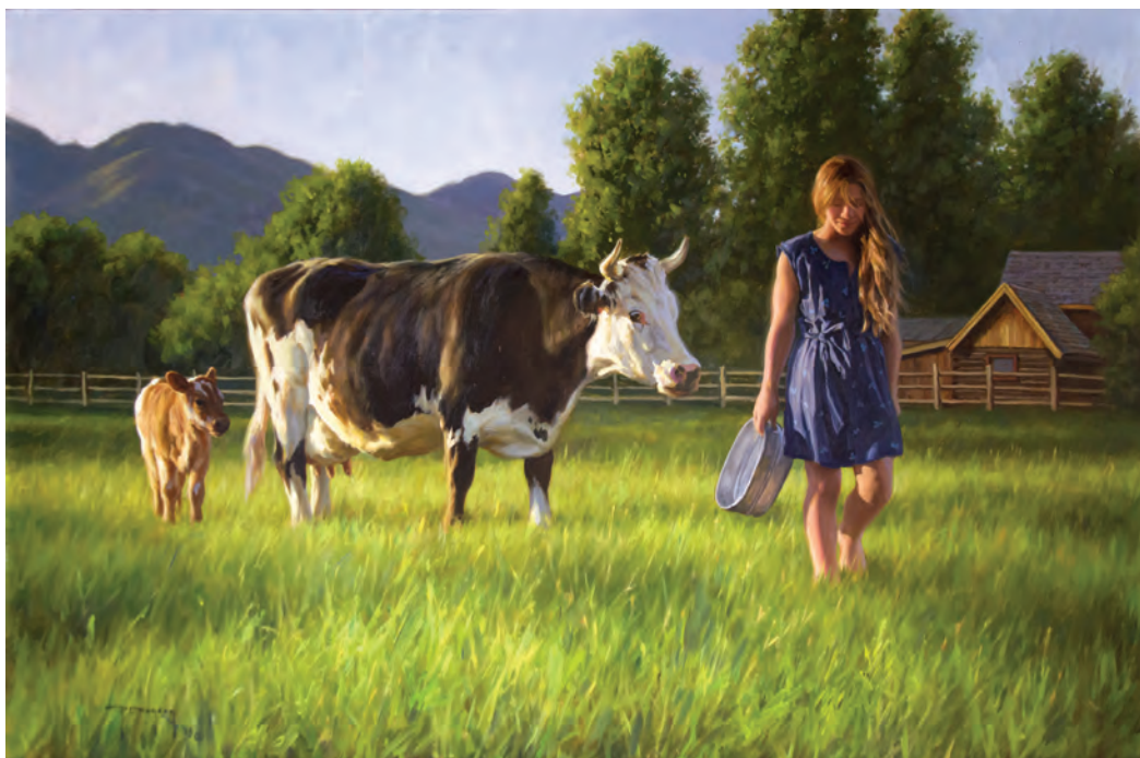
The New Mother , oil on canvas, 24 x 36 inches, $12,000