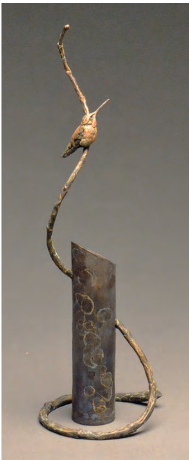
Stefan Savides, Flower Child , bronze ed. of 35, 21 x 7 x 6 inches, $2,100