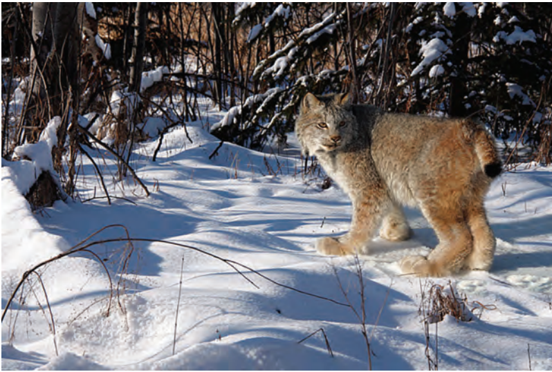
Bruce Lawes, Searching the Shadows , oil on linen, 24 x 36 inches, $12,950