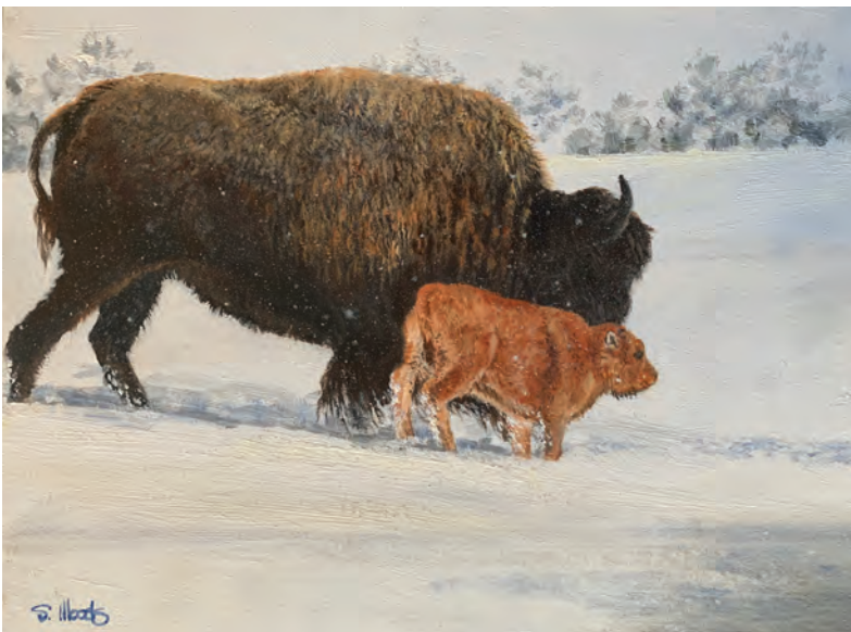
Sarah Woods, Wyoming May Baby , oil on board, 12 x 16 inches, $2,000