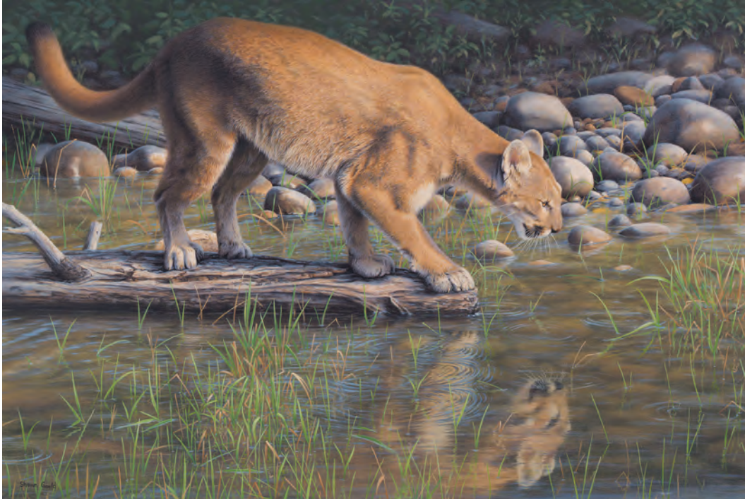
Shawn Gould, Mirror Mirror , acrylic on board, 24 x 36 inches, $6,400