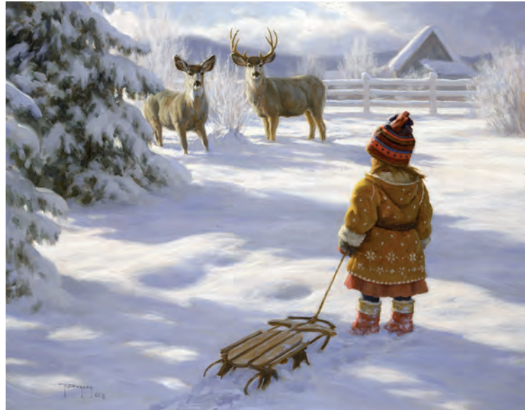
Robert Duncan, A Welcome Sight , oil on linen, 22 x 28 inches, $8,500

Jackson Hole is well known for attracting all manner of wildlife enthusiasts including artists, writers, photographers, and nature buffs. With this in mind, we are pleased to take a walk on the wild side as we present our annual Wildlife Discovery show. Many of the country's most noted wildlife painters and sculptors participate in the event, providing an eclectic mixture of wildlife and nature subjects. We continue to see wildlife art as a dominant