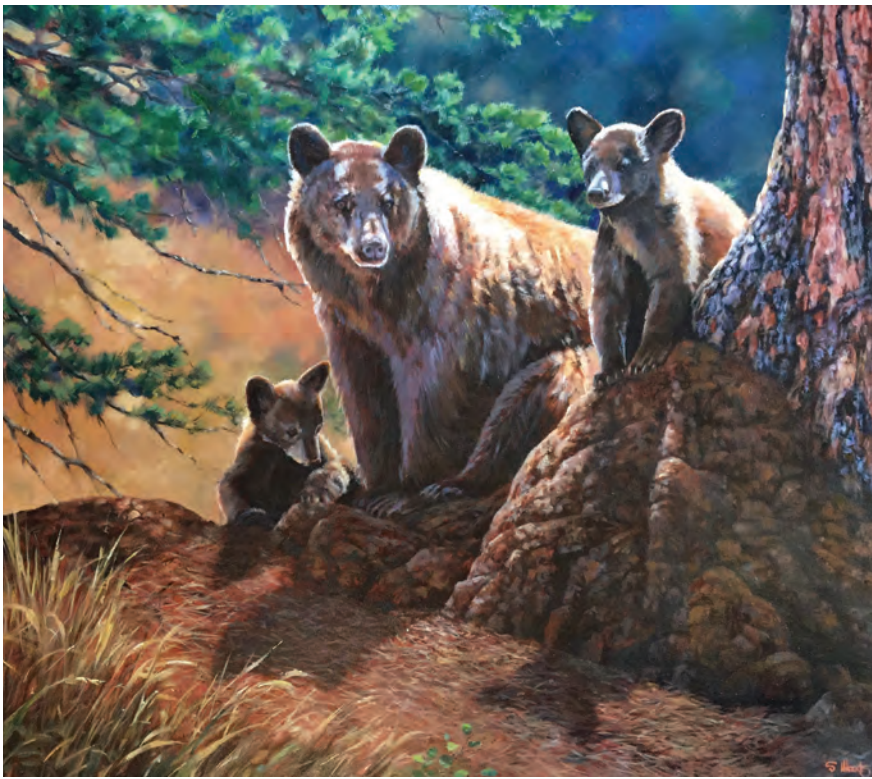
Sarah Woods, The Learning Tree , oil on canvas, 34 x 32 inches, $9,500