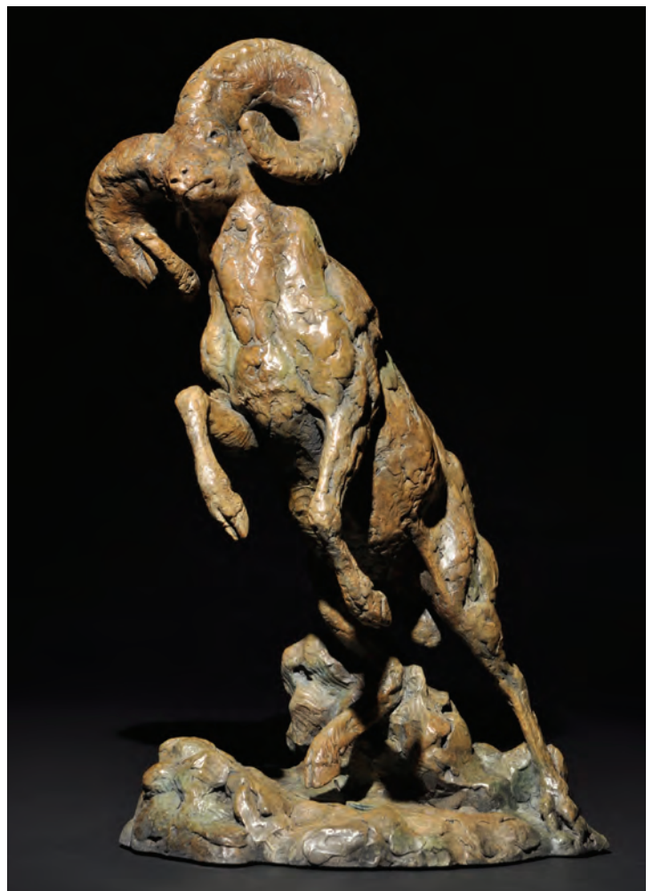
Mick Doellinger, Incoming , bronze ed. of 25, 29 ½ x 17 ½ x 13 ½ inches, $8,300