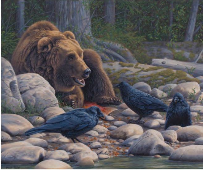
Shawn Gould, Lifblood of the River , acrylic on board, 20 x 24 inches, $3,700