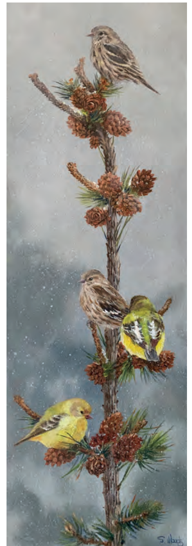
Sarah Woods, Softly Snowing , oil on board, 24 x 8 inches, $2,000