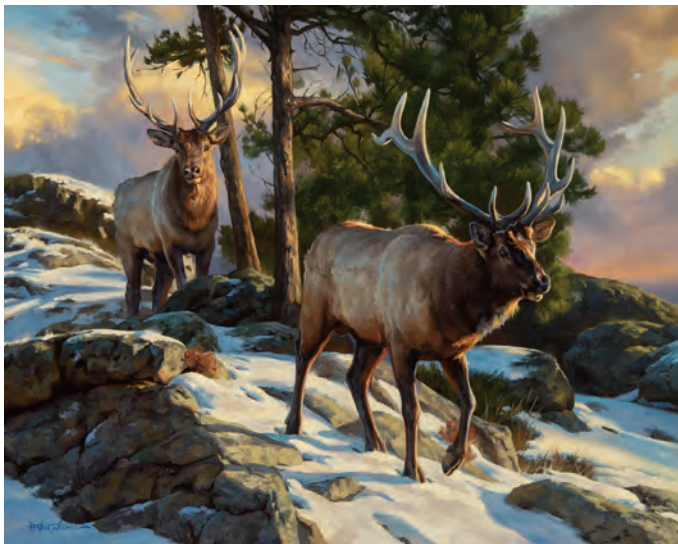
Dustin Van Wechel, A Winter Fellowship , oil on canvas, 24 x 30 inches, $7,500

genre in the art world. Given the heightened awareness of global warming and fragile ecosystems, the genre has taken on a whole new dimension, as the artists strive not only to create an esthetically pleasing image, but to have it serve as an educational tool to bring more awareness to conservation. I hope that these works serve to inspire an even deeper appreciation for our relationship with nature.