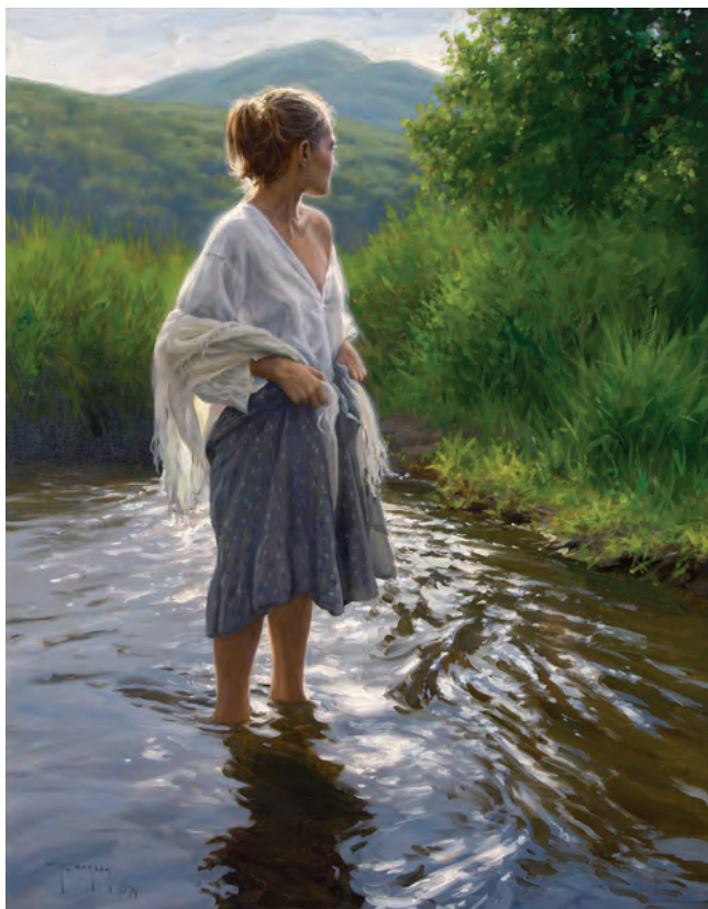
Her Quiet Place , oil on linen, 28 x 22 inches, $8,000