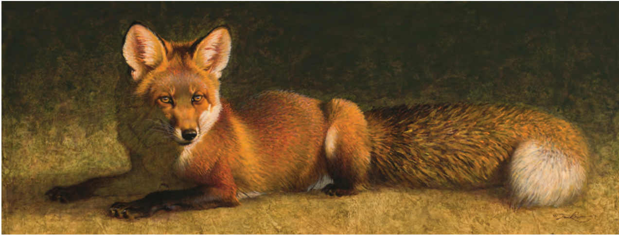
Ezra Tucker, Little Scarlet , acrylic on board, 15 x 40 inches, $14,000