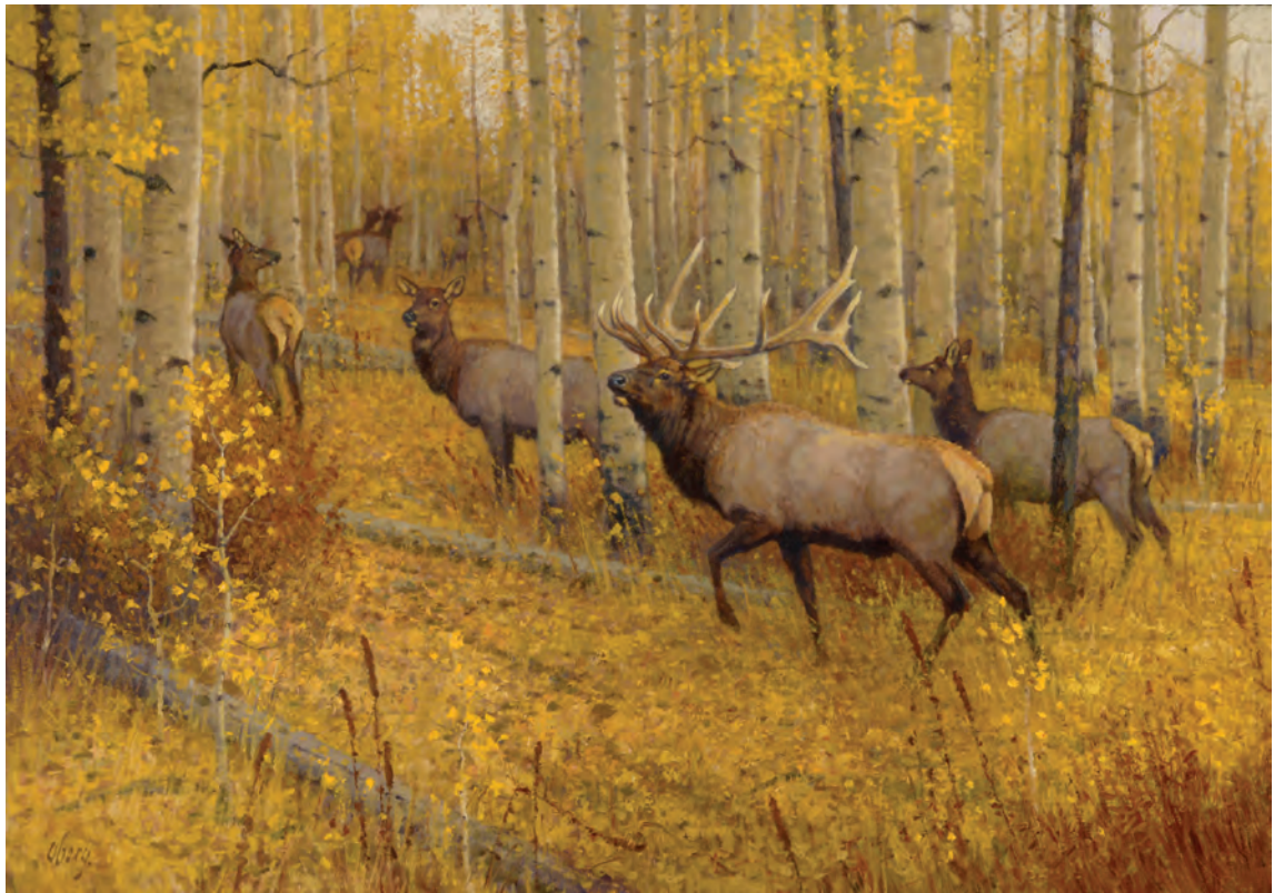
Ralph Oberg, The King's Crown , oil on mounted linen, 34 x 48 inches, $24,000