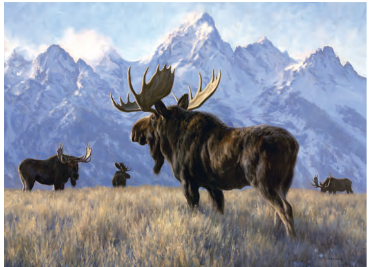
Robert Duncan, Winter's Coming , oil on linen, 36 x 48 inches, $25,000