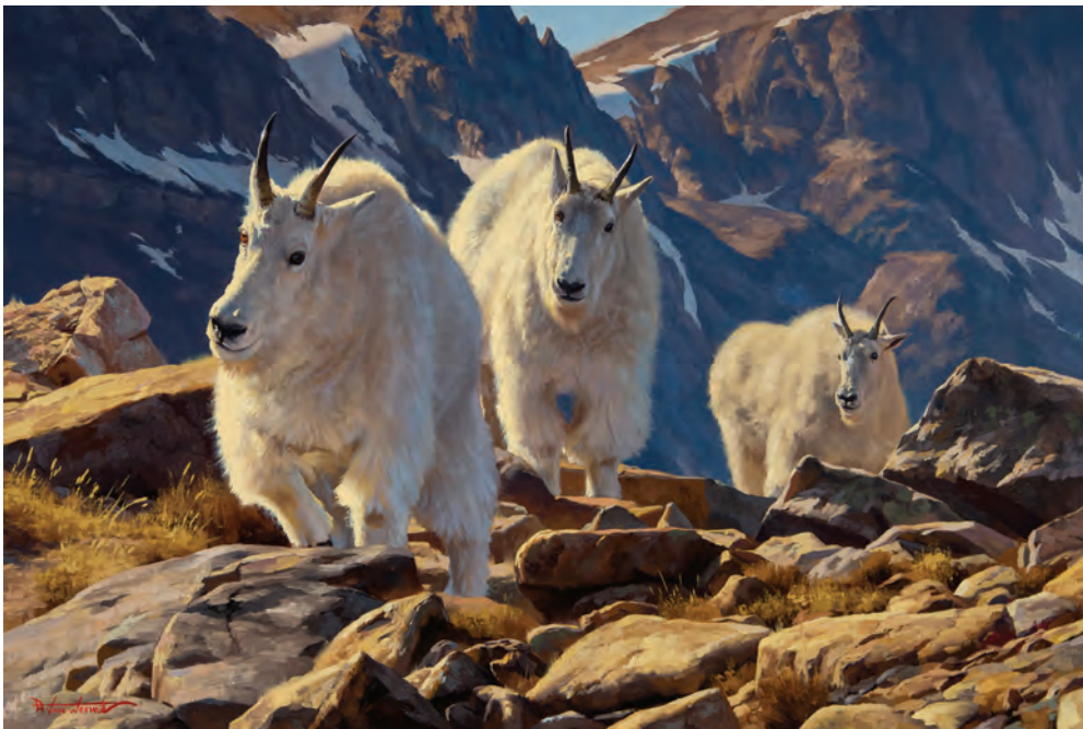
Dustin Van Wechel, Make Way , oil on canvas, 24 x 36 inches, $9,000