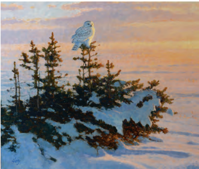
Ralph Oberg, Winter Sun , oil on mounted linen, 20 x 24 inches, $7,400