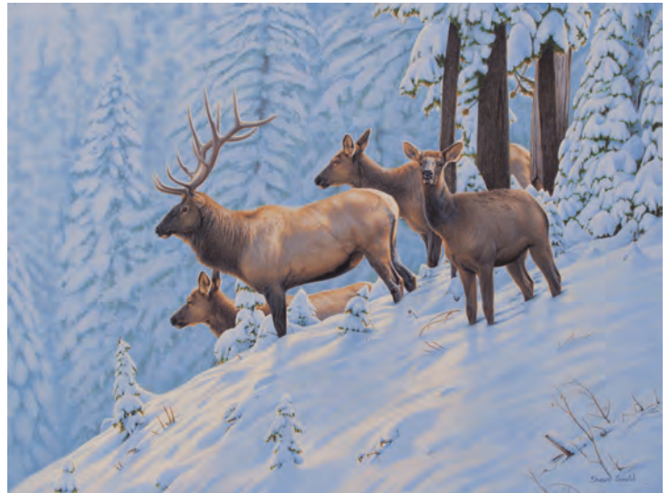
Shawn Gould, Early Snow , acrylic, 18 x 24 inches, $3,400