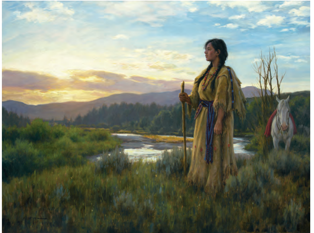
Young and Strong , oil on linen, 30 x 40 inches, $22,500

MARCH 4 - MARCH 16, 2019 Open House: Saturday, March 16, 4-6pm