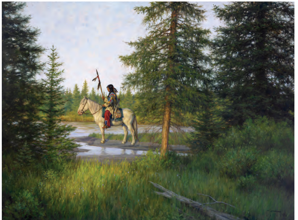
Through the Pines , oil on linen, 36 x 48 inches, $29,500