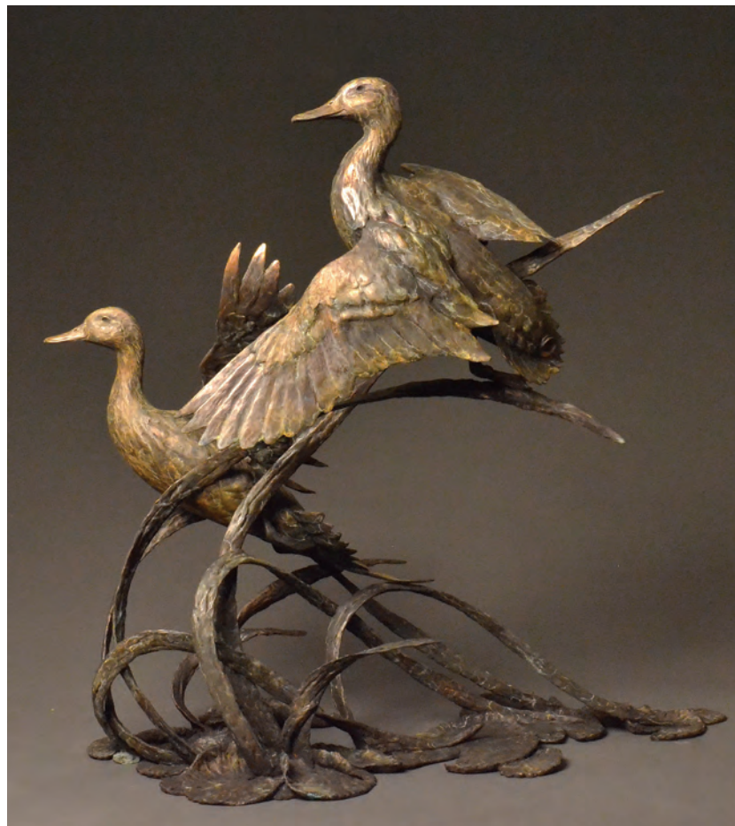
Stefan Savides, Pins and Curls , bronze ed. of 16, 33 x 33 x 25 ½ inches, $12,000