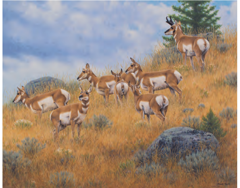
Shawn Gould, Open Country , acrylic on board, 24 x 30 inches, $5,400