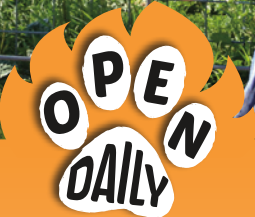
Congo Safari Lodge