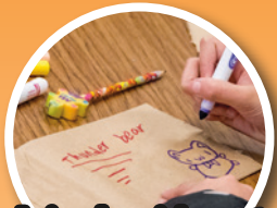
Animal enrichment workshops

With programming ranging from short weekend Keeper Talks to extended day camps and workshops, we offer a variety of immersive learning options for all ages.