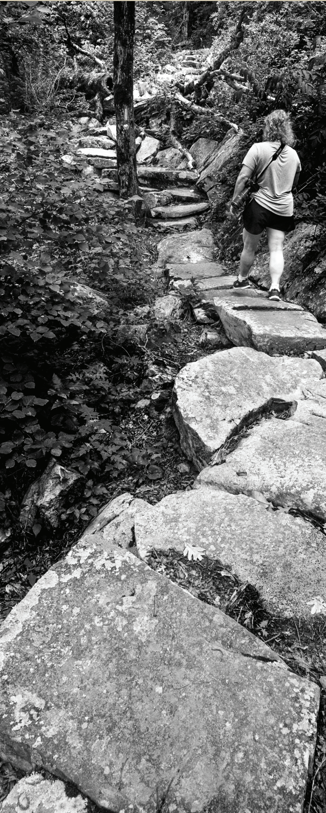
Arkansas State Parks 2025