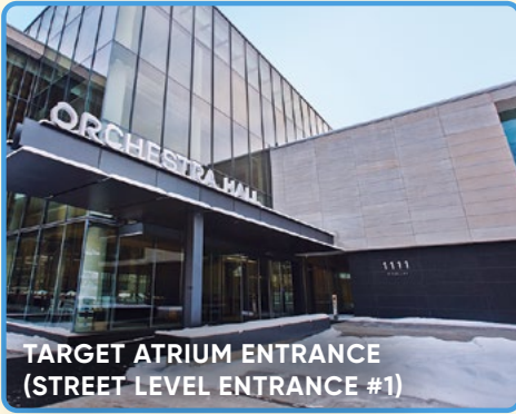
TARGET ATRIUM ENTRANCE (STREET LEVEL ENTRANCE #1)