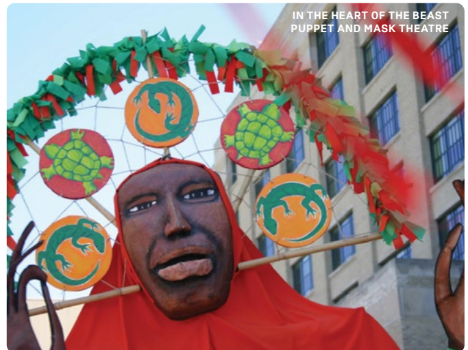
IN THE HEART OF THE BEAST PUPPET AND MASK THEATRE