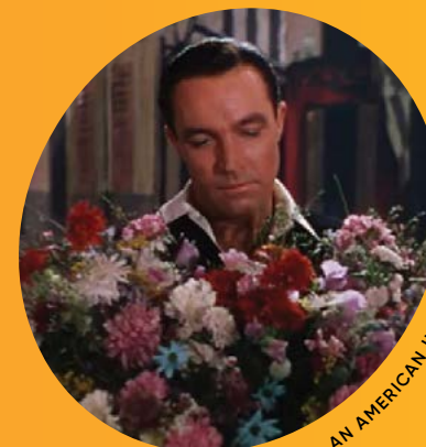
AN AMERICAN IN PARIS