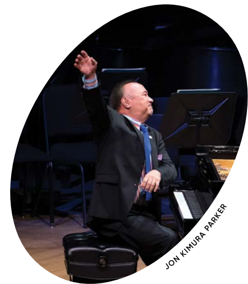
JON KIMURA PARKER

*THE MINNESOTA ORCHESTRA DOES NOT PERFORM ON THIS PROGRAM.