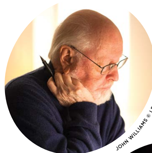
JOHN WILLIAMS © LEFTERISPHOTO.COM

SUBSCRIBERS SAVE UP TO 15% ON ANY CONCERT