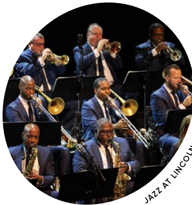
JAZZ AT LINCOLN CENTER ORCHESTRA