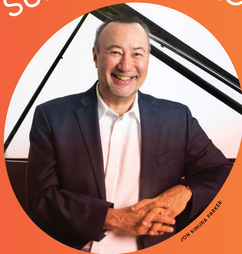
JON KIMURA PARKER

"Join me as we dive into one of music's most transformative decades—the Roaring Twenties. The years following the First World War produced immense cultural transformation and significant artistic innovation. Composers sought to find new forms of musical expression—and jazz was at the center. I'm thrilled to perform works by Ravel and Gershwin, two prolific composers inspired by jazz. Plus, you'll hear works written for ballets and operas that illustrate the genre's enduring influence on orchestral music. Our festival wraps up with An American in Paris , the 1951 American film inspired by Gershwin's symphonic poem of the same name. You won't want to miss it!"