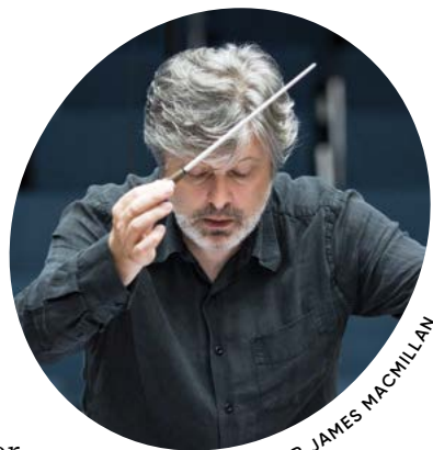
SIR JAMES MACMILLAN