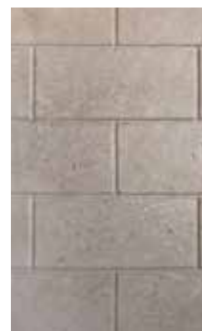
White Stacked Refractory Liners