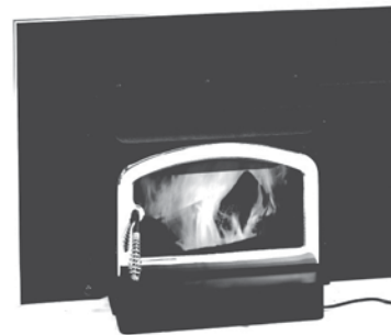
Striker™ C160AGL with Arch Door