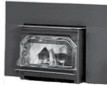
Striker™ C160TGL with Traditional Door