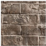
Traditional Brick Liner