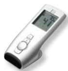
PF1 or MV