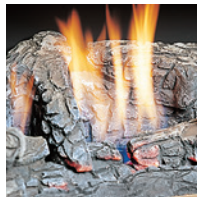
Fibre Oak Log Set