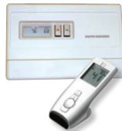
PF1 or MV

On/Off, Thermostat On/Off, Thermostat On/Off modulating