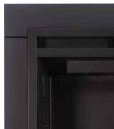
Optional 4 or 3 piece trim kit