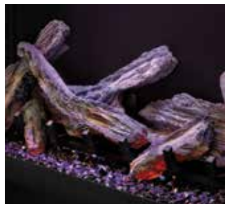
Red / Blue