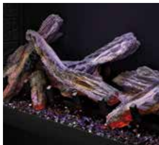
Yellow / Blue