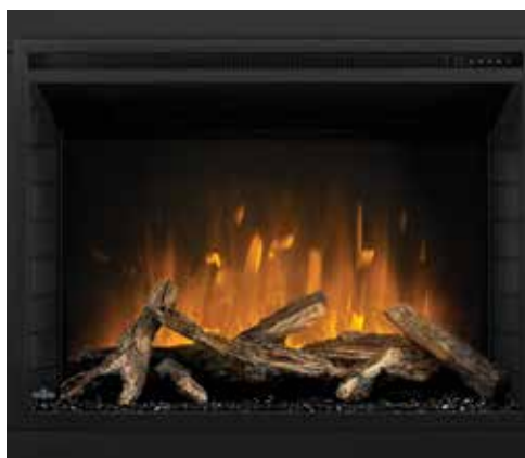
Included: Log set (for 36" model) | Log set (for 42" model)