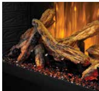
Yellow / Red