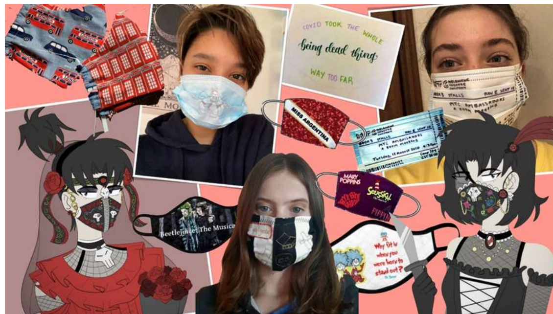
MTC Ambassador masks