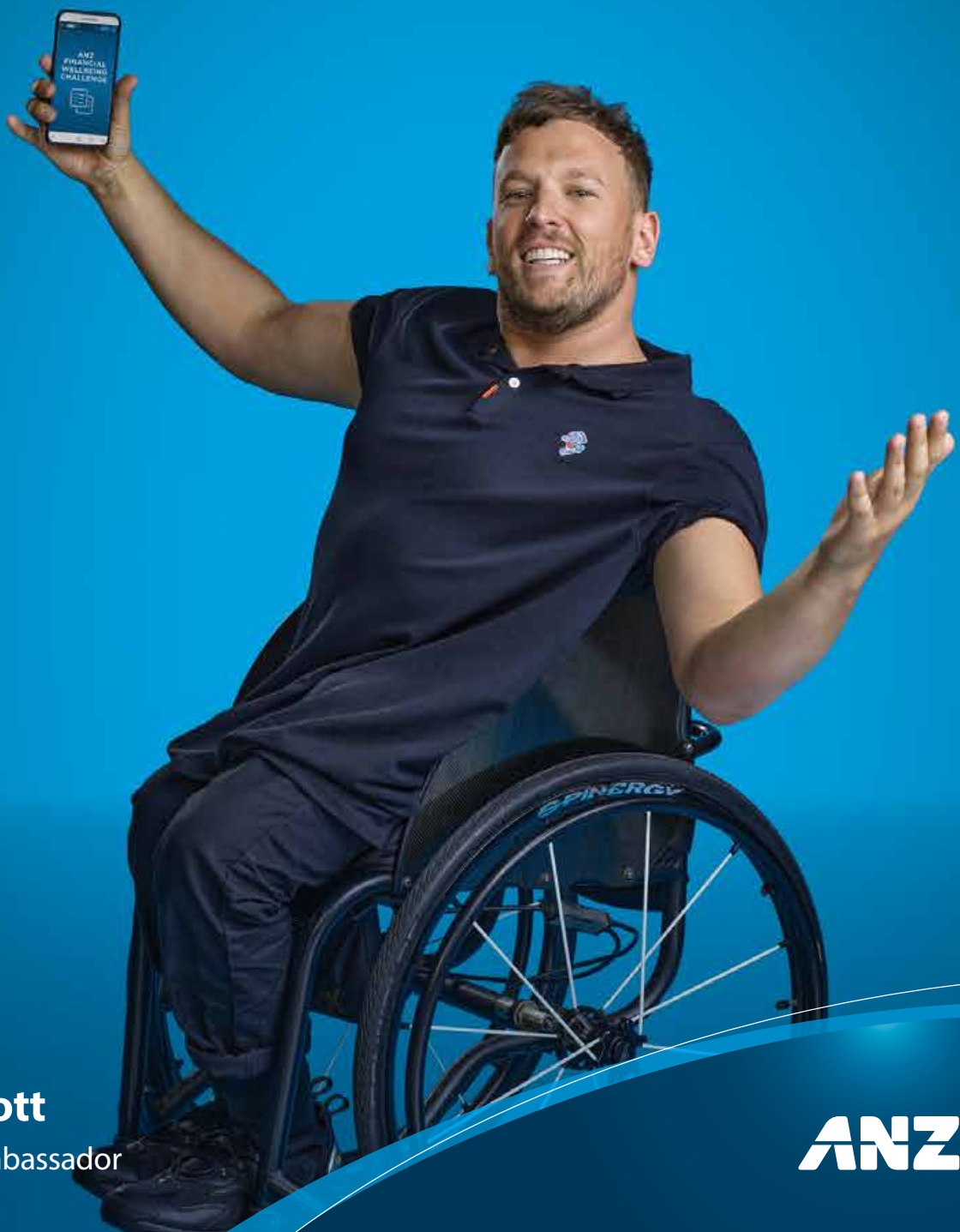
Dylan Alcott ANZ Tennis Ambassador