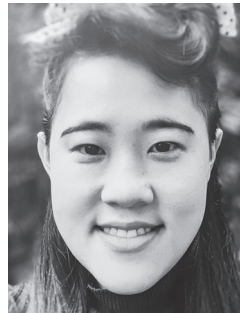
Mykei By Roshelle Fong