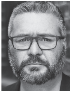
AIRCON By Blayne Welsh