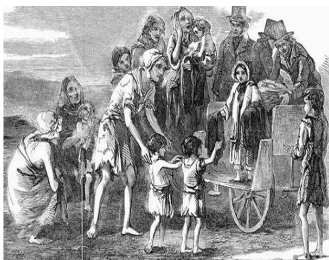
Irish Humanitarian 1846-1847