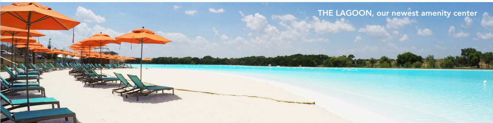
THE LAGOON, our newest amenity center