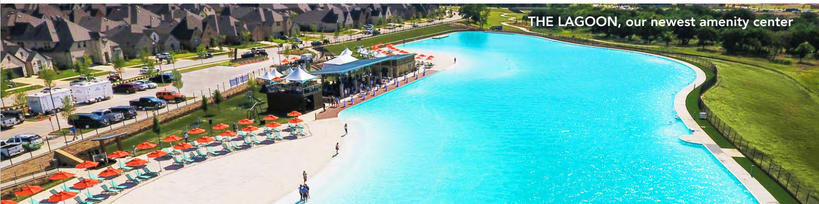
THE LAGOON, our newest amenity center