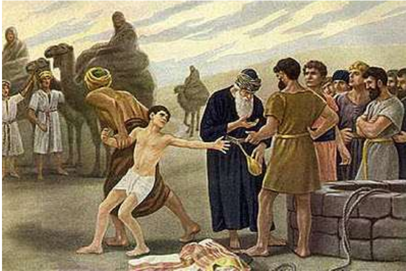
Joseph is sold