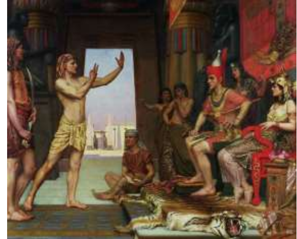
Joseph interprets Pharaoh's dreams