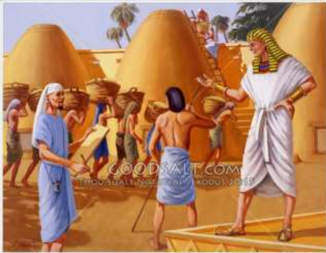
Joseph prepares for famine