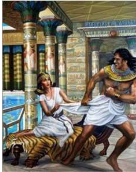
Joseph in Potiphar's house