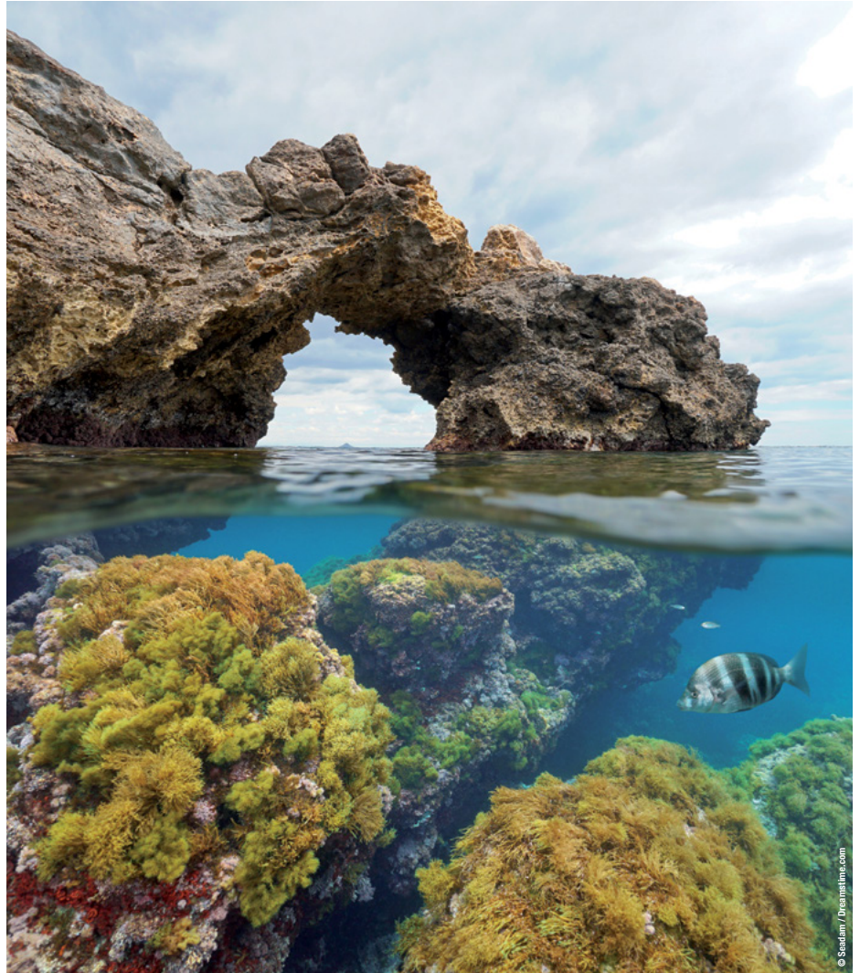
Cabo de Palos, Spain

MPAs will be affected by storm duration, intensity and direction. Extreme storms may induce significant direct (e.g. flooding, coastal erosion , damage to properties) and indirect (e.g. salt intrusion, land subsidence, vegetation destruction) impacts to the coastal zone but also in the marine realm. Shallow sublittoral communities will be affected by abrasion and damage can affect deeper habitats and community diversity. Severe storms have been shown to affect also coralligenous outcrops [ref.12], posing threats to their resilience.