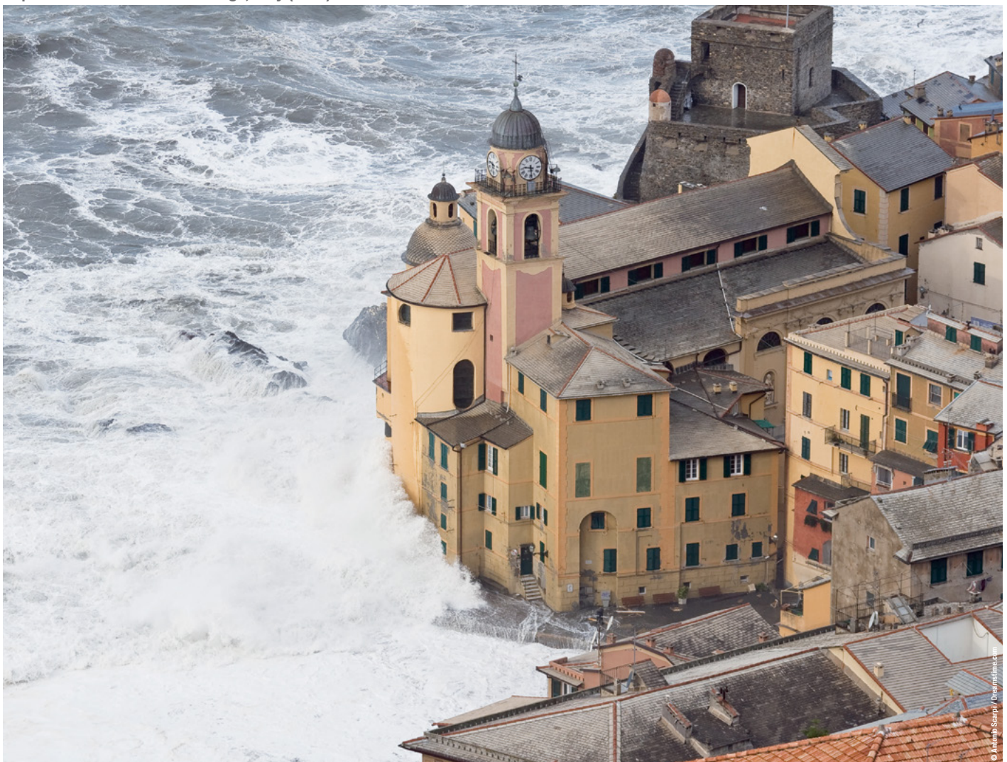
Impacts of a sea storm in Camogli, Italy (2018)

While they will be fewer ordinary to moderate storm events, it is likely the increase of frequency of violent cases with winds over 60-90 kt ( 1\text{kt} = 0,51\text{m s}^{-1} ) -Mediterranean hurricanes or medicanes- over the whole Mediterranean Sea as the century progress. This risk is largest over the western Mediterranean basin with a maximum probability that they occur around in October [ref.10].