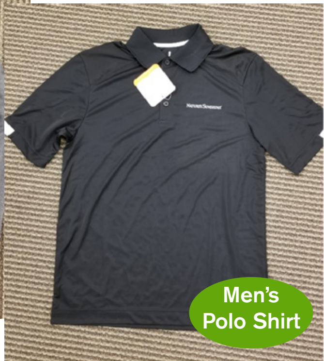
Men's Polo Shirt

Sign up 12 new* members with 100+ PV and automatically receive a NSP embroidered lady's grey Jacket or men's black Polo Shirt.