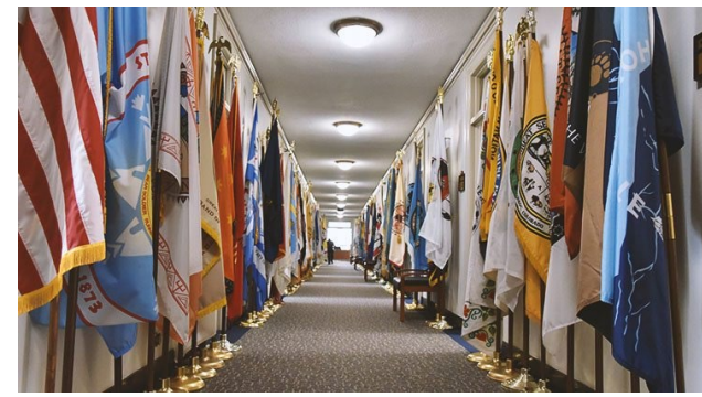
Indian Affairs FY 2022 Enacted