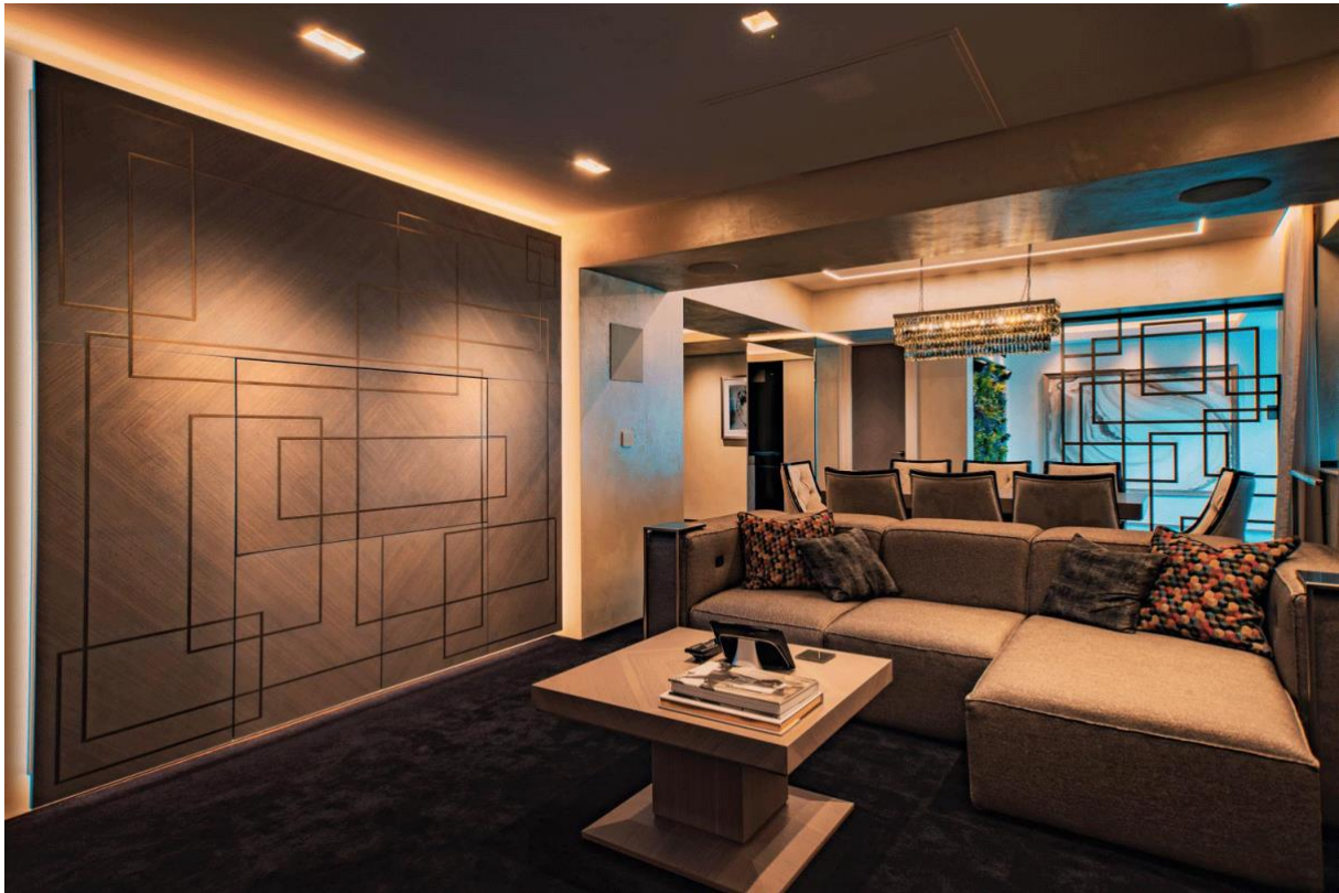
Smart joinery design helps hide the screen and Sliding Panel System

The Media Room also contains a hidden gem in the form of a 55" display, concealed by a Future Automation SPS Sliding Panel System . Almost invisible thanks to the clever joinery design around the sliding panel, the display is smoothly and quietly revealed as the joinery panel drops back into the wall cavity and lifts up before the screen is pushed flush with the surrounding panels.