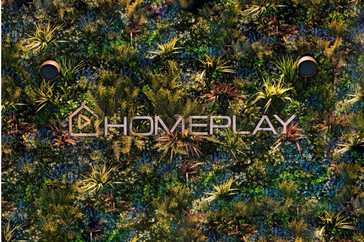
The stunning "Vertical Garden" at the Homeplay Experience Centre

Upon entering you're met with the beautiful "Vertical Garden", designed to not only draw in clients with its interesting aesthetics but also showcase Homeplay's branding, as well as their ability to offer customers smart outdoor audio solutions.