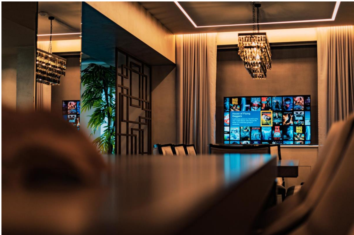
A Future Automation PL TV Lift behind the meeting desk

Like all our DIN Rail Enclosures , they are also available Pre-Wired or "Site Ready" as part of our Enclosure Wiring Service .