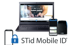
STid Mobile ID® Online Portal Web-based platform for remote management of your virtual cards

* Attention: information on communication distances: measured at the center of the antenna, depending on the positioning of the vehicle, the antenna configuration, the installation environment of the reader, the supply voltage, and the local regulations in effect. External disturbances can cause the reading range to decrease. The reading performance depends on the positioning of the tag and the type of windshield. Impervious windshields can affect reading performance. It is imperative to place the tag in the resist zones.