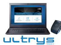
ULTRYS programming kit and SSCP® and OSDP™ protocols