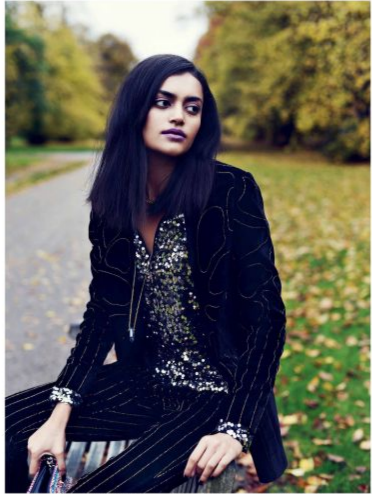
Sequined blazer, H&M, ₹ 4,500; velvet trouser suit, Haenn, ₹ 45,000; 'Raw Quartz' necklace, ShopLuxe, ₹ 1,400; twined bag, Dior, price on request