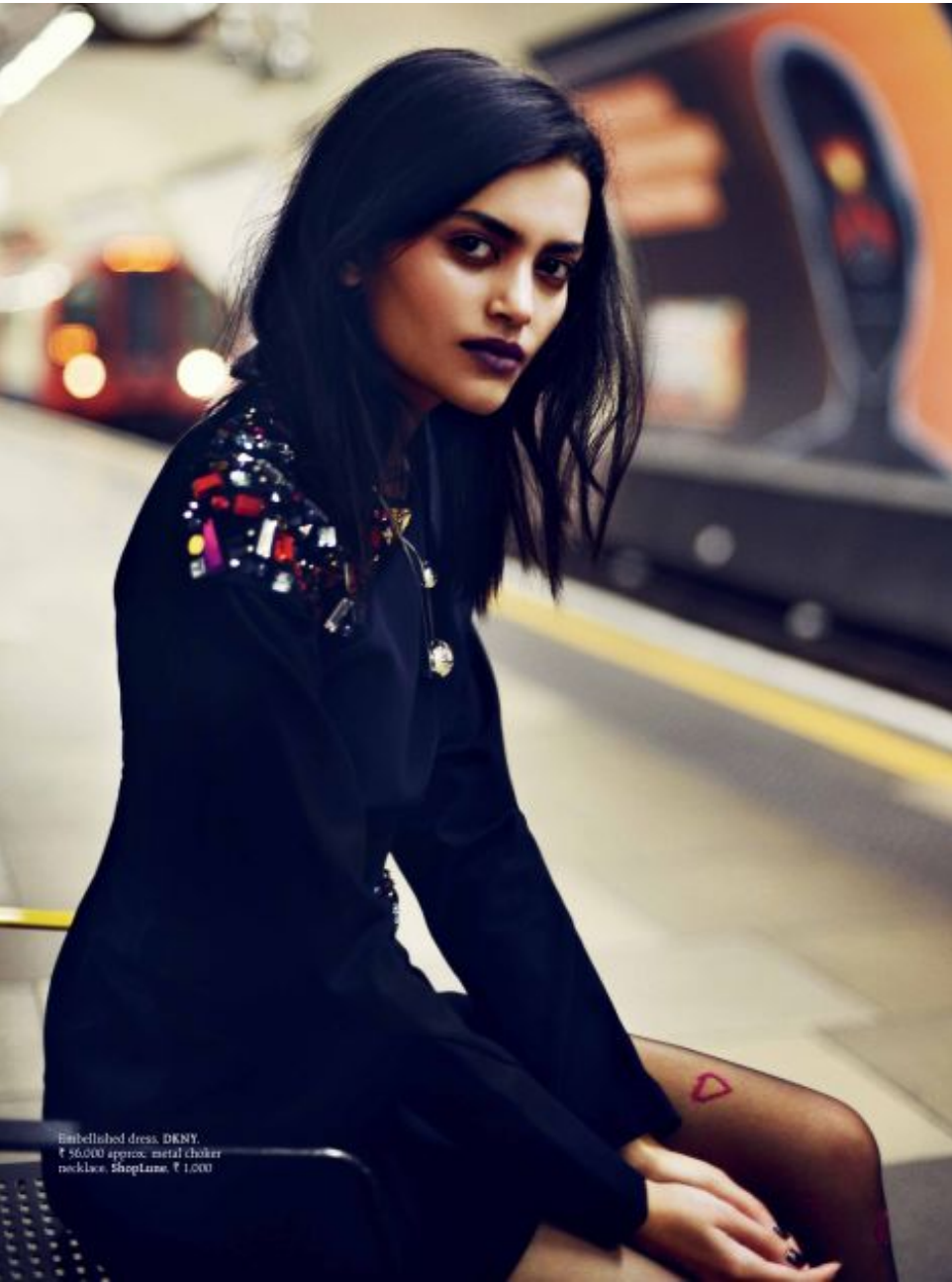
Embellished dress, DKNY, ₹ 56,000 approx. metal chair necklace, ShopLuxe, ₹ 1,000