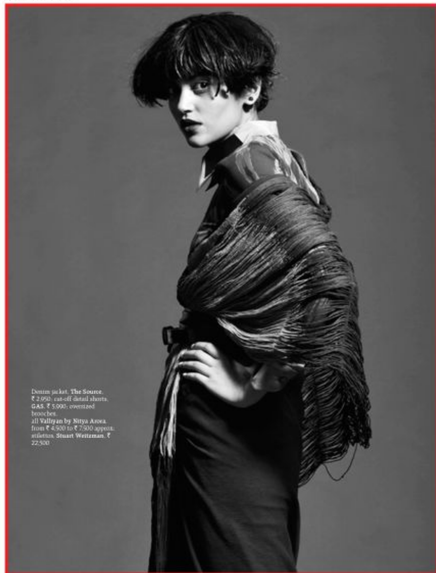
Denim jacket, The Source. ₹ 2,050; cat-off detail shorts, GAS, ₹ 5,000; oversized brooches, all Wallivan by Nitya Anwa. from ₹ 4,500 to ₹ 7,500 approx. sandals, Stuart Weitzman, ₹ 22,500.