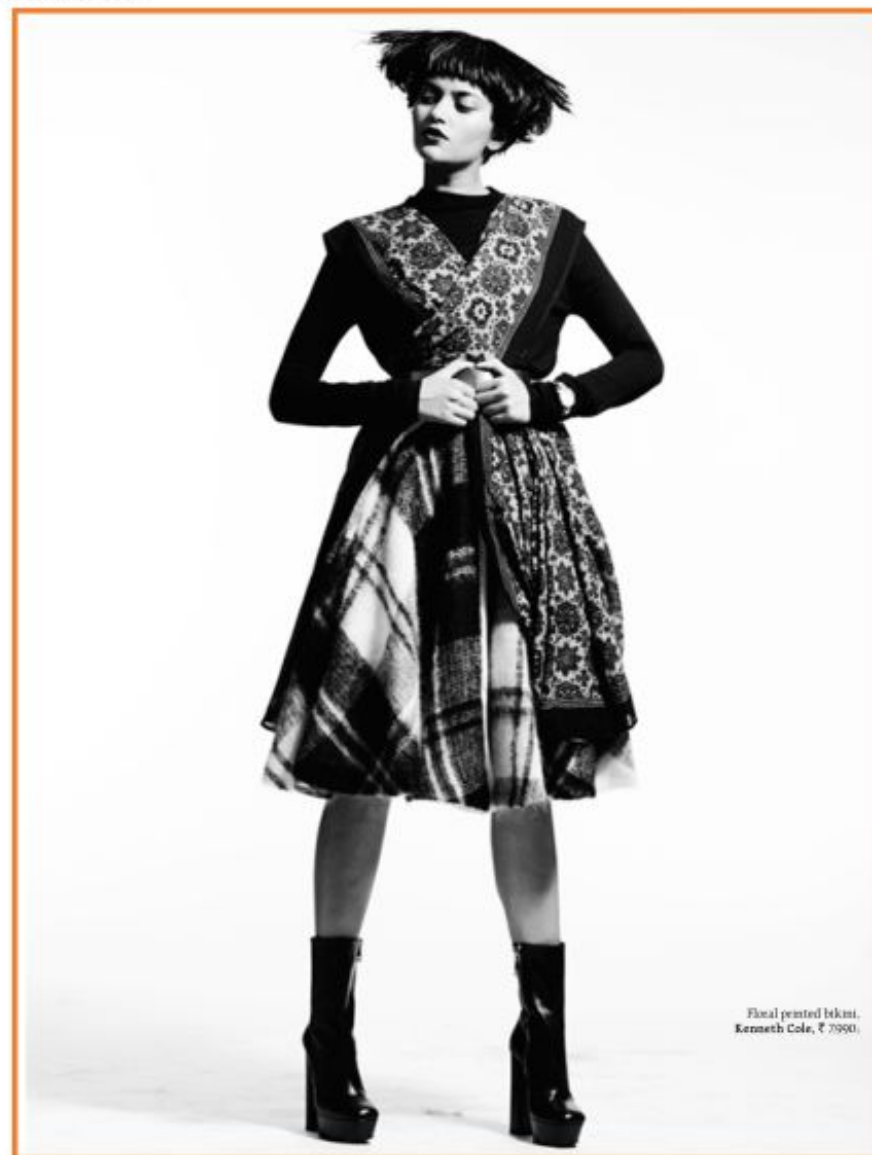
Floral printed bikini, Kenneth Cole, ₹ 7,990.