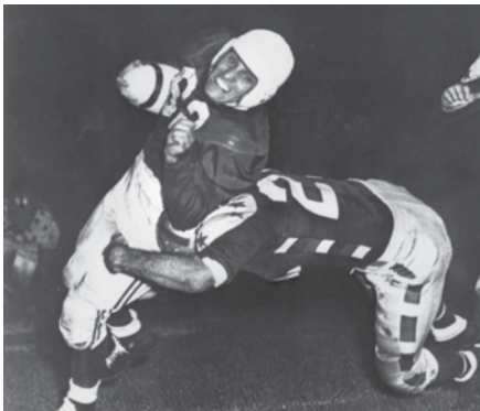
Charley Trippi's 5.1-yard rushing average is the best career average in Cardinals history.

9 .....Ottis Anderson, 1979 7 .....Ottis Anderson, 1979 6 .....Ottis Anderson, 1980 5 .....Jim Otis, 1976