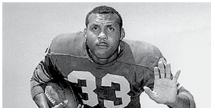
Hall of Fame RB Ollie Matson holds the franchise record for career kickoff return TDs (6).