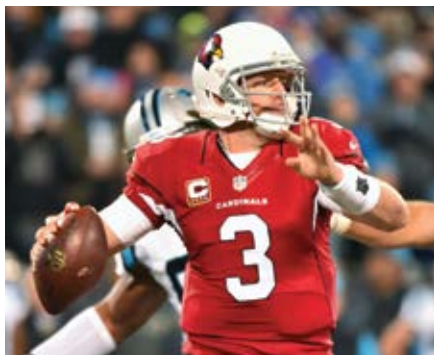
In 2015, Carson Palmer set a franchise record with nine 300-yard passing games along with single-season records for passing yards, TDs and QB rating.