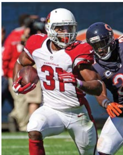
RB David Johnson returned a kickoff 108 yards for a TD against the Bears in 2015. It was the longest TD in franchise history and is tied for the second longest play in NFL history.