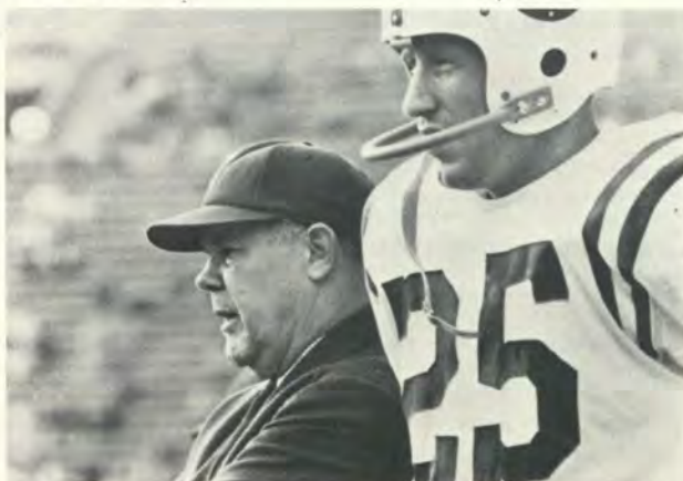
Weeb Ewbank led Colts to first World Championships in '58 and '59.