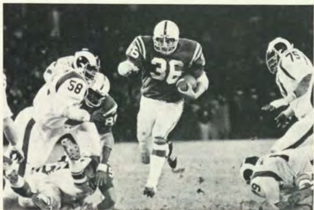
Norm Bulaich was selected to the Pro Bowl in 1971.