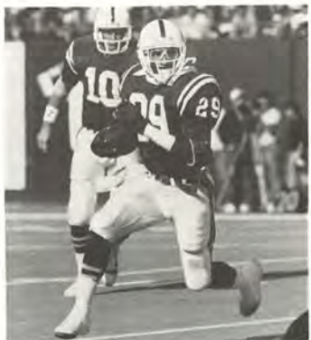
Colts running back Eric Dickerson was club's first All-Pro choice since 1983.