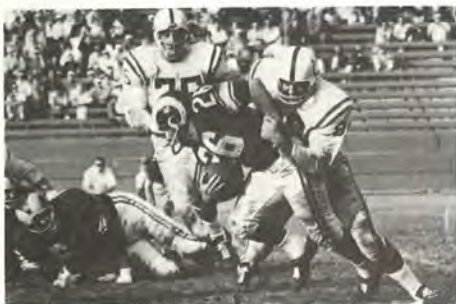
1972 inductee Gino Marchetti appeared in 10 Pro Bowls and was named All-Pro nine times.