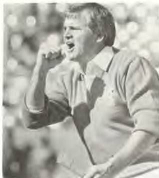
Ron Meyer led Colts to division title in 1987.