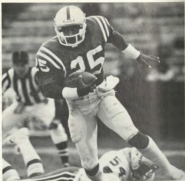
Glasgow set three Colt records for kick and punt returns.