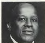
Buddy Young 1954