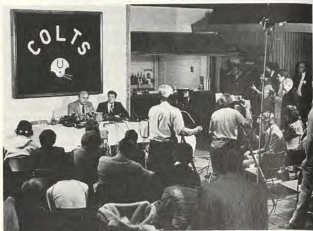
January 16, 1980, Mike McCormack named head coach of the Baltimore Colts.