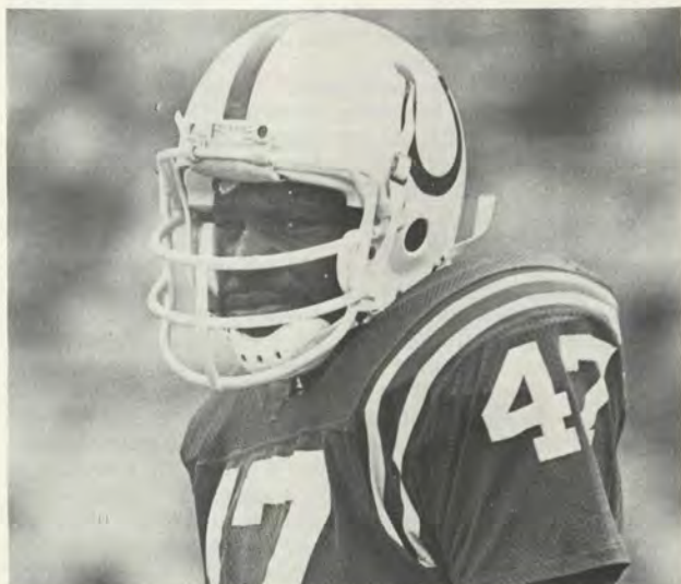
Rookie Braziel tied for team honors in interceptions.