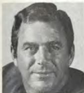
Jimmy Orr 1965