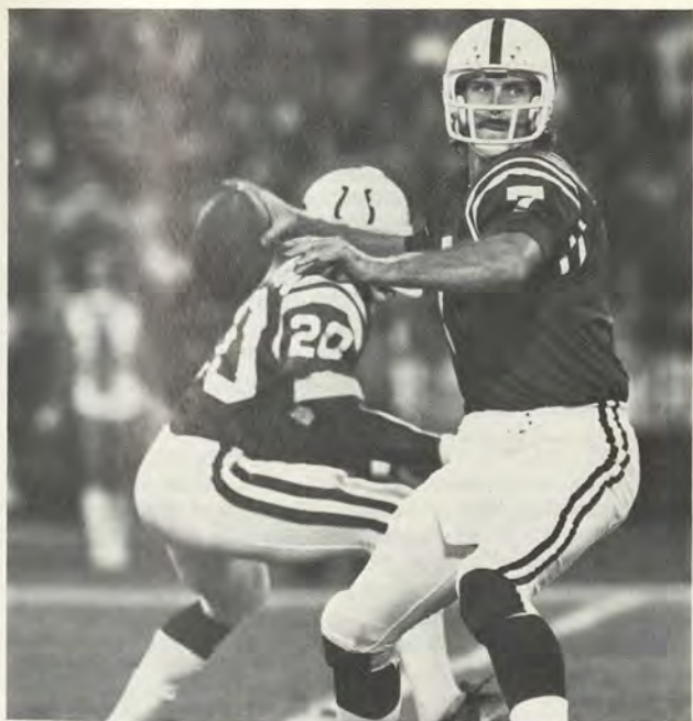
Bert Jones is the top rated active NFL quarterback with an 80.3 rating.