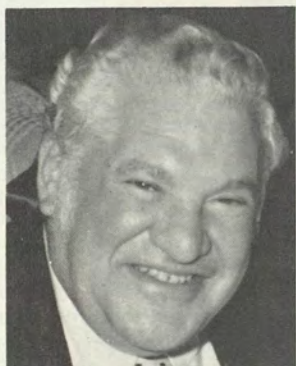
ROBERT IRSAY President and Treasurer